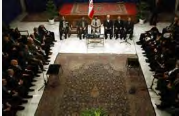
The international Holocaust denial conference held in Tehran on December 11 and 12, 2006. Ahmadinejad sits in the center. Sixty-seven participants from 30 countries attended the conference, among them several notorious Holocaust deniers. The conference agenda included discussions on whether or not there was a Holocaust, how extensive it was, how many Jews were killed, were there gas chambers or not, how it influenced Zionism, etc.

establishment of the State of Israel, and thus prepare the ground for its destruction . The so-called "Jewish problem," as far as the Iranian regime is concerned, is essentially a European problem which has to be resolved in Europe by letting the Jews live there and their protégées. However, the Islamic Palestinian state will be established on the ruins of the State of Israel.