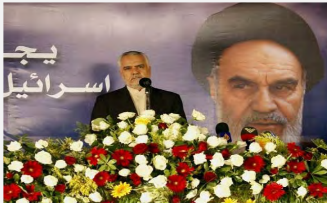
[Mohammad-Reza Rahimi, vice president of Iran (20minutes.fr website, June 28, 2012)]

Iran's vice-president makes a blatant, openly anti-Semitic speech at a UN-sponsored anti-drug conference in Tehran, accusing the "Zionists" of responsibility for global drug trafficking. The speech is another example of Iran's frequent use of anti-Semitism as a weapon to further its regional strategic goals.