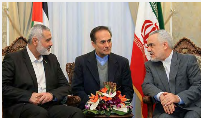
Iranian Vice President Mohammad-Reza Rahimi (right) with Ismail Haniya, head of the de-facto Hamas administration in the Gaza Strip

2) The Iranian regime seeks to increase its influence among the Palestinians and represents itself as the standard-bearer of their struggle to regain their "rights." The heads of the Iranian regime represent the Palestinians as the real victims of the Holocaust and of the implementation of The Protocols of the Elders of Zion by Israel and the Zionist Movement. That enables them to wage an anti-Semitic, anti-Israeli campaign and to represent themselves to the Arab world and the Palestinians as defending Palestinian rights and promoting their goal of the destruction of the State of Israel. The anti-Israeli campaign accompanies an anti-Semitic campaign side by side with support for Palestinian terrorism and strengthening ties with Hamas, which also uses the "weapon of anti-Semitism." 5