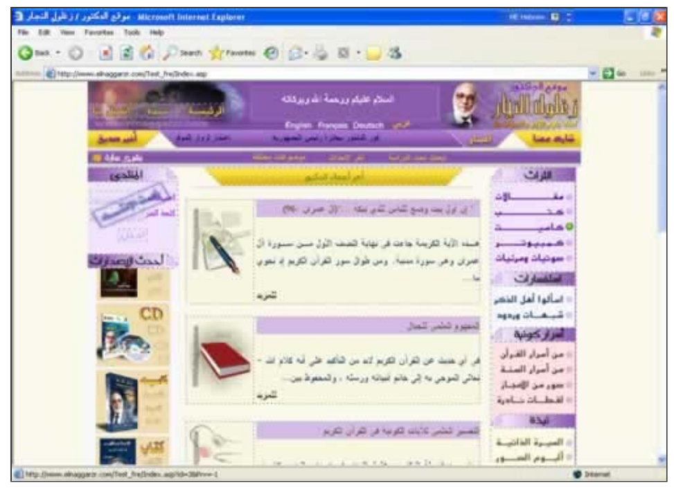
Spreading anti-Semitism and preaching violence camouflaged as a "respectable" Internet site: Dr. el-Naggar's home page.