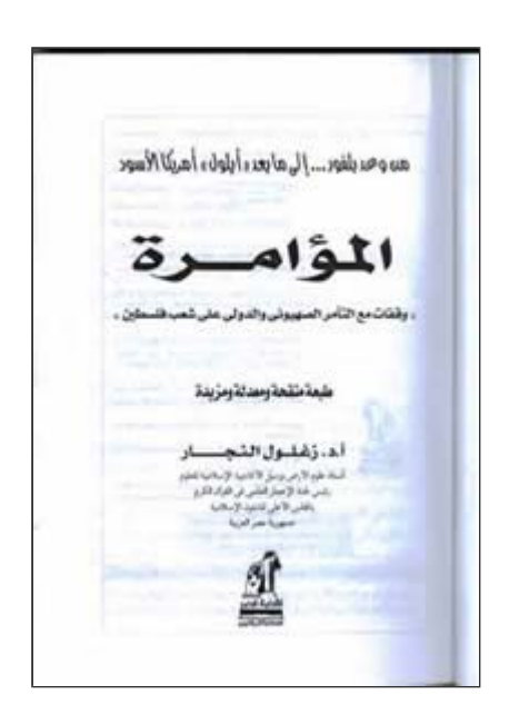
The Plot: Milestones in Zionist and World Subversion of the Palestinian People Messages on the front cover and title page

• It should be noted that the motifs appearing in the books are not original, but are recycled from the wealth of anti-Semitic material published in Egypt and the Arab-Muslim world. It should also be noted that the books nourish and are in turn nourished by the current on-going public discourse in the Arab-Muslim world regarding Holocaust denial, as begun by the statements made by Iranian president Ahmadinejad.