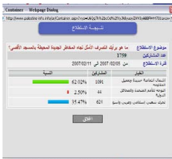
The results of the “survey”

B. The Website also offered a permanent “survey” asking visitors to the site what they thought was the correct action to take against the dangers menacing Al-Aqsa mosque. The preferred course of action (62.02%) was fomenting a new terrorist campaign ( intifada ) and employing “resistance” (i.e., terrorism and violence). The second preference (35.47%) was a broad, popular Arab-Islamic [propaganda] campaign.