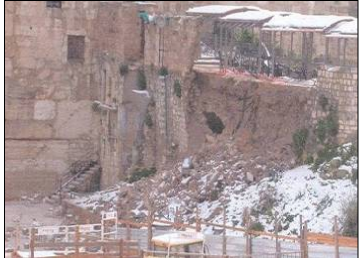
Israel Antiquities Authority

Left: The collapse of the Mugrabim ramp. Right: the Mugrabim ramp, view from the Archaeological Park.