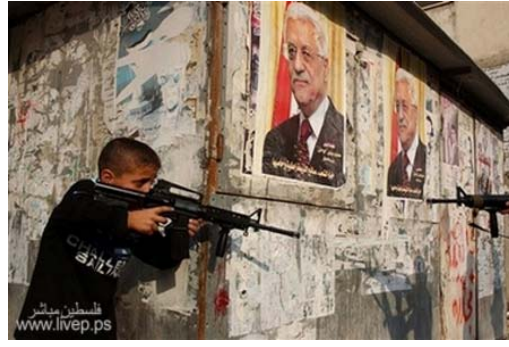
Palestinian children playing with toy guns sold on Eid al-Fitr in Judea and Samaria (Filisteen Mubashir Website, October 15), endangering their lives.

3. Over the past few years a number of Palestinian youths have been injured by mistake by IDF soldiers when they held guns and rifles which later turned out to be toys. Some of the more prominent incidents were the following: