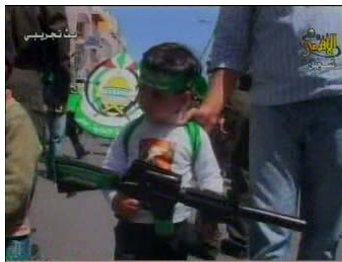
A Palestinian child at a Hamas demonstration in Ramallah held to commemorate Ahmad Yassin and Abd al-Aziz Rantisi (Al-Aqsa TV, April 6, 2007).

5. Indoctrinating children to violence and hatred (manifested by games with toy guns) is one way the terrorist organizations prepare new generations of terrorists , and makes it difficult for Israel and the PA to reach a long-term agreement. In addition, the terrorist organizations often recruit youths to carry out real terrorist attacks, including suicide bombing attacks (despite the criticism of the Palestinian populace regarding the use of adolescents in terrorist missions 2 ).