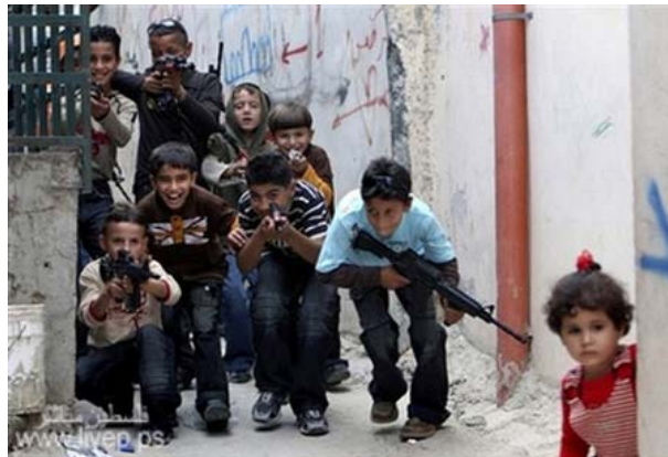
Children playing with plastic rifles (Filisteen Mubashir Website, October 15).

Palestinian children playing with plastic weapons, copying the fighting methods of the terrorist organizations. The games are part of the education they receive in hatred and violence against Israel. The toy weapons are very similar to real ones and playing with them is liable to endanger the children's lives.