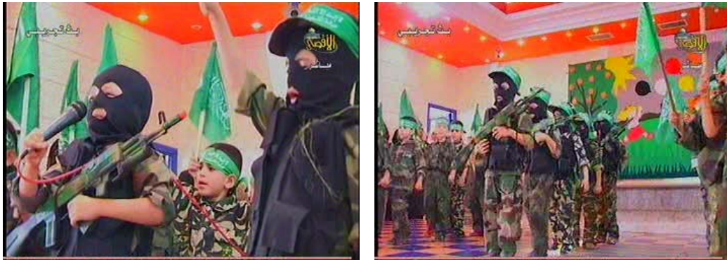
A kindergarten children’s “military display.” They are dressed as Hamas operatives and carry toy guns (Al-Aqsa TV, May 31, 2007).

5. Indoctrinating children to violence and hatred (manifested by games with toy guns) is one way the terrorist organizations prepare new generations of terrorists , and makes it difficult for Israel and the PA to reach a long-term agreement. In addition, the terrorist organizations often recruit youths to carry out real terrorist attacks, including suicide bombing attacks (despite the criticism of the Palestinian populace regarding the use of adolescents in terrorist missions 2 ).