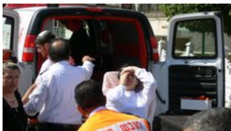
A rocket which hit the yard of a house in Sderot on February 17 sent five people into shock and damaged the building (Noam Badin for the Sderot Media Center, February 17).