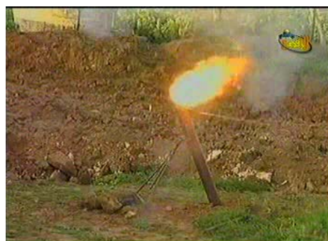
Launching mortar shells: the trip wire which launches the shell is visible at the right (Al-Aqsa TV, February 12).