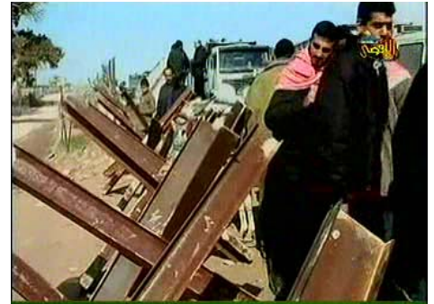
Palestinians delayed in Egypt returning to the Gaza Strip (Al-Aqsa TV, February 18).

■ On February 18 the Egyptians opened the Salah al-Din Gate near the Rafah Crossing in coordination with the Hamas police. Egypt allowed 350 Palestinians who were delayed on its territory to enter the Gaza Strip. According to Egyptian “security sources” there are still 2,500 Palestinians staying with relatives in the northern Sinai peninsula (Reuters, February 18).