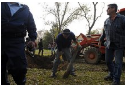
A rocket hit in the center of Kibbutz Nir Am (near Sderot)