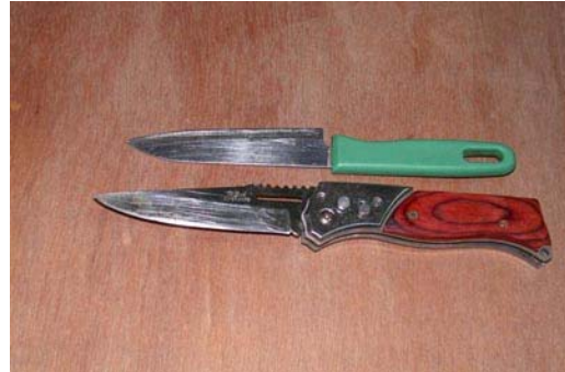
Knives found in a terrorist's possession (IDF Spokesman, February 12).