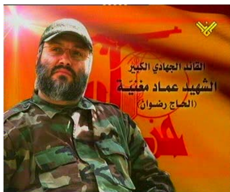
Imad Moughnieh (Al-Manar TV, February 14)

■ At about 22:00 (10 p.m.) on February 12 a car blew up in the Soussa residential neighborhood in Damascus, killing a mastermind Hezbollah terrorist. The following morning Hezbollah officially announced the death of Imad Moughnieh and blamed Israel (Al-Manar TV, February 13). An official statement issued by the Israeli Prime Minister's media advisor on February 13 said that Israel was examining the reports from Lebanon and Syria regarding Moughnieh's death and making an initial study of the details available in the media. The statement noted unequivocally that Israel rejected the attempts of terrorist elements to implicate in any way in the event.