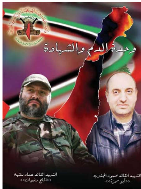
Identification with Imad Moughnieh and turning him into a role model for the Palestinian terrorist organizations: a PIJ poster linking the killing of Moughnieh to that of a PIJ terrorist in Lebanon in May 2006 (Qudsnet Website, February 19).

announced an “open war” with Israel, that is, a war without borders and going beyond the Lebanese-Israeli arena, and not limited by time or place.