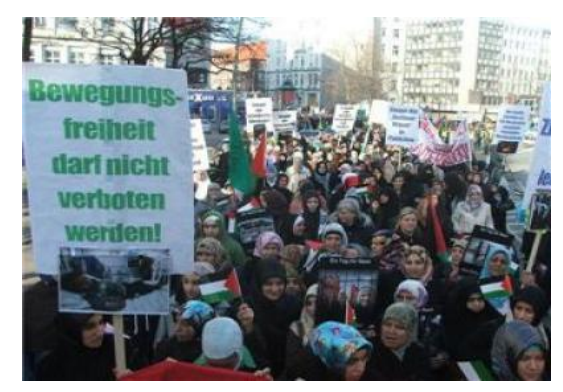
The Dutch identify with the Palestinians: "Freedom of movement must not be prohibited" (Freegaza.ps Website, February 25).

policemen and riot control equipment to prevent Palestinians from forcing their way into Israel. In effect, contrary to what Hamas expected , only a few thousand Gazans participated in the chain instead of the expected tens of thousands, many of them school children bussed to the site and women brought there by Hamas. Hamas blamed the poor showing on the inclement weather and the massive presence of Israeli security forces.