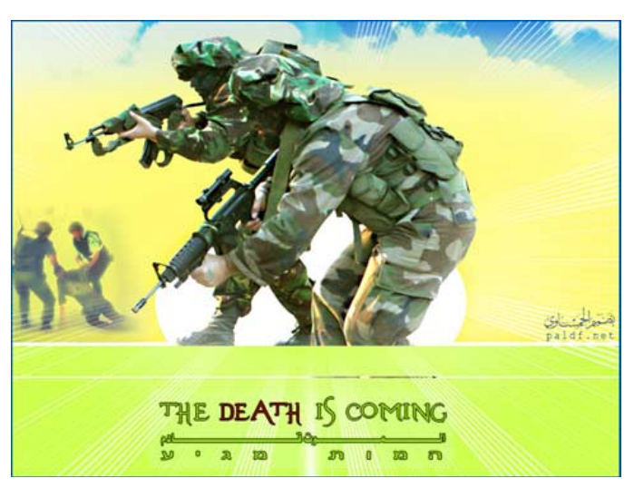
Poster in English and Hebrew promising more terrorist attacks