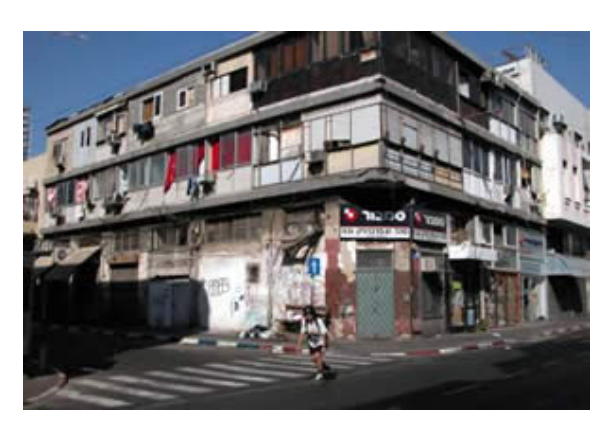
The building in Tel Aviv where the police found the explosive belt which was supposed to be used by the suicide bomber (Yuval Arel for the Israeli Police Department).