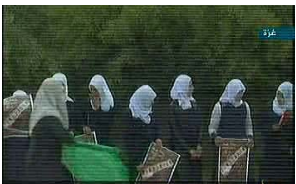
Hamas's human chain protesting Israeli sanctions (Al-Jazeera TV, February