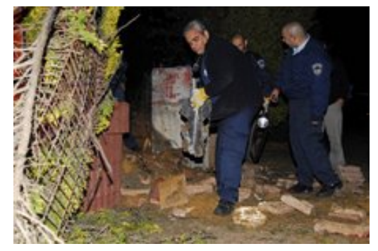
A rocket which hit the yard of a house in Sderot (, February 25).