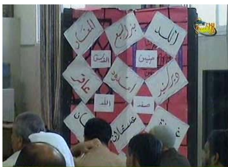
Inculcating “the right of return:” display at a Hamas rally in Gaza City to mark Nakba Day, with the names of Israeli cities to which the Palestinians expect to return

■ Hamas, for its part, has exploited Nakba Day for a propaganda campaign against Israel and the Jewish people. Its television station has broadcast programs glorifying Hamas terrorist operatives, belligerent statements against Israel have been made and anti-Israel, anti-Jewish and anti-Western propaganda programs have been aired. The campaign has invested a special effort in children’s programs, which are rife with hatred for Israel and brainwash them with the message that “the Palestinians will soon return to Jaffa, Acre, Lod, Ramla and Ashdod, and also to Tel al-Rabia [i.e. “Tel Aviv” in Arabic]” (From a children’s program broadcast by Al-Aqsa TV on May 2).