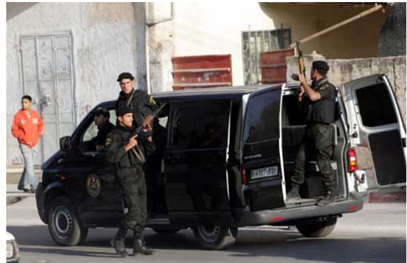
Members of the Palestinian security forces in action in the town of Qabatiya, near Jenin (PALDF Forum, May 6).

■ About 500 members of the Palestinian security forces recently stationed in the Jenin region began enforcing law and order and putting an end to the anarchy in northern Samaria (the operation is nicknamed "Smile and Hope").