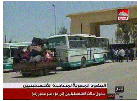
Palestinians passing through the Rafah Crossing on their way from the Gaza Strip to Egypt (Egyptian TV, May 12).