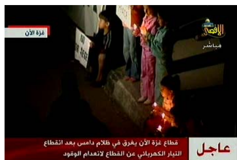
Gazan children holding candles to “light the darkness” in the Gaza Strip.