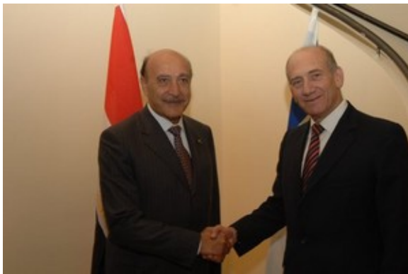
Israeli Prime Minister Ehud Olmert and head of Egyptian General Intelligence, Omar Suleiman, meet in Jerusalem (Amos Ben-Gershon for the Israeli Government Press Office, May 12).

...and the rocket and mortar shell attacks continue