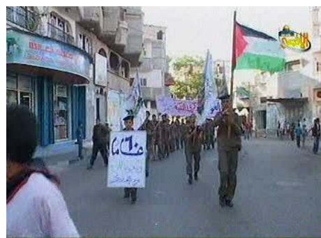
Children’s demonstration in Gaza to mark Nakba Day.