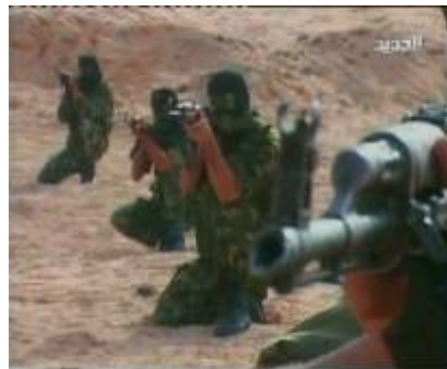
TV shots showing PIJ operatives undergoing military training during the lull (NTV, July 8).