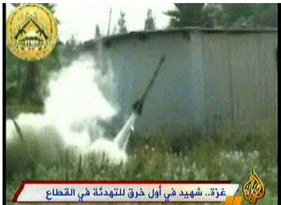
Fatah's Al-Aqsa Martyrs Brigade fires rockets (Al-Jazeera TV, July 10).