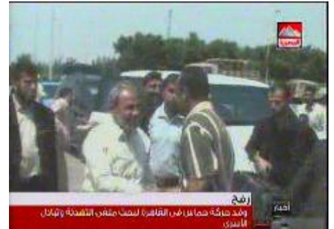
Hamas delegation headed by Mahmoud al-Zahar leaving the Gaza Strip for the meeting in Cairo (Egyptian TV, July 8).