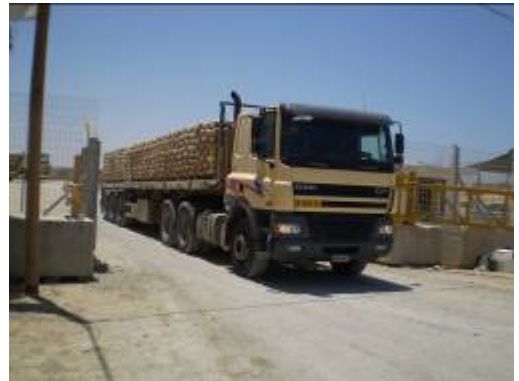
Truck carrying sacks of cement through the Sufa crossing (Information Center, July 10).