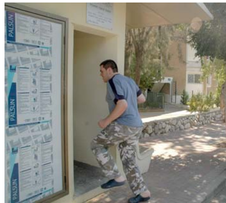
Sderot resident entering a protected area (Zeev Trachtman, July 10).