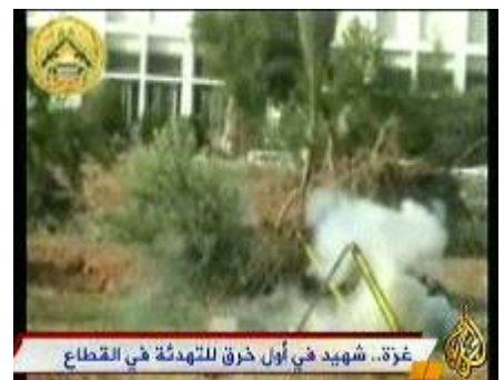
Fatah/Al-Aqsa Martyrs Brigade firing rockets (Al-Jazeera TV, July 10).