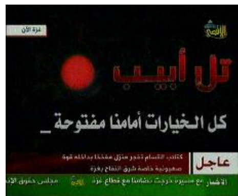
From an Al-Aqsa TV video: Hamas threatens Tel Aviv (Al-Aqsa TV, January 10, 2009).