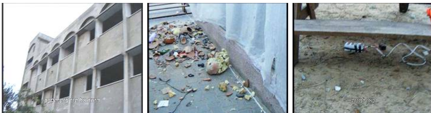
Left: The school building. Center: The fuse (the white cord) around the building visible near the wall. Right: One of the IEDs (IDF Spokesman, January 11, 2009).

■ As Operation Cast Lead continues, additional examples come to light showing how Hamas uses the civilian population in the Gaza Strip as human shields as part of its combat strategy. 2 A prominent example occurred on January 11 when an IDF force operating in the northern Gaza Strip came upon a school in the Zeitun neighborhood which had been completely booby-trapped. A delayed-action fuse led from the school to a small zoo situated nearby, which still had animals in the cages. The IDF soldiers neutralized the IED. A weapons cache, including rifles and RPG launchers, was found inside the school.