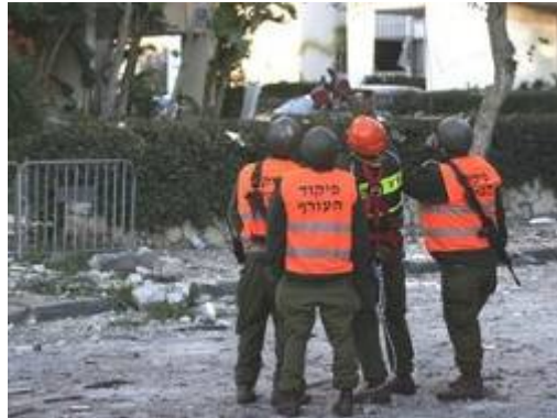
Home front soldiers at the scene of a rocket hit near a kindergarten in Ashdod (Picture courtesy of NRG, by Edi Israel, January 11, 2009).

■ During the morning hours of January 11 the city of Beersheba was attacked twice by rocket fire; four civilians were treated for shock. At 1600 hours a 122mm Grad rocket hit the city of Ashdod , landing close to a kindergarten which was empty at the time; two civilians were treated for shock. At 2100 hours a barrage of five rockets was fired at the city of Ashqelon; no injuries were reported.