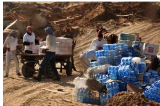
Left: Unloading the food on the Israeli side. Right: Palestinian families come to receive humanitarian aid (IDF Spokesman, January 11, 2009).