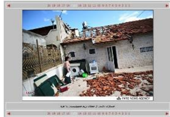
Left: The subtitle reads “Hamas fire hits one of the Zionist settlements.” Right: The subtitle reads “IDF fires at houses in the Gaza Strip” (Iran’s Fars News Agency).