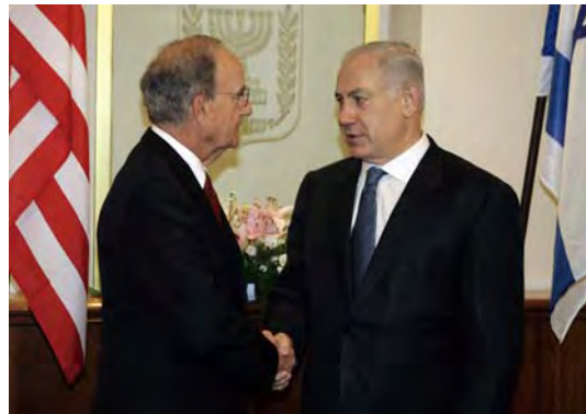
Israeli Prime Minister Benjamin Netanyahu with George Mitchell, special American envoy to the Middle East (Photo: Omar Awad for Reuters, September 16, 2009).