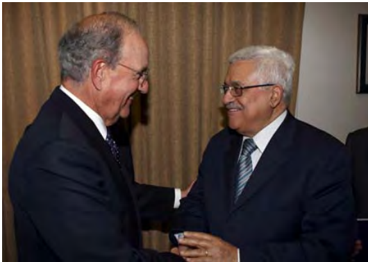
Palestinian Authority Chairman Mahmoud Abbas with George Mitchell (, September 16, 2009).