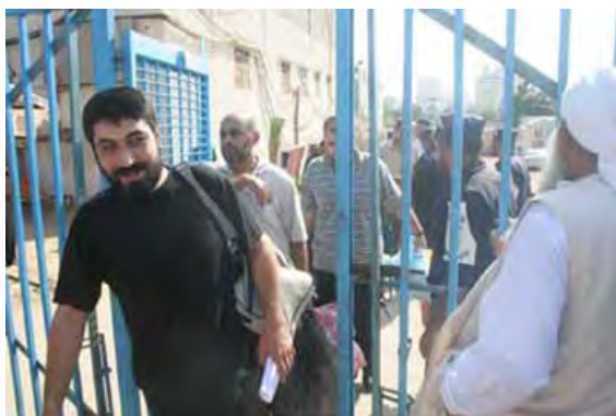
Hamas releases prisoners for Eid al-Fitr (Hamas' Palestine-Info website, September 19, 2009).

administration" said that the 50 security prisoners were members of the Salafist organization Jund Ansar Allah who had been detained after the events in Rafah (Reuters, Agence France-Presse, September 17; Al-Aqsa TV, September 17 and 18, 2009).