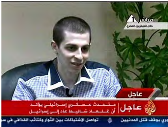
Gilad Shalit interviewed by Egyptian TV after his release (Egyptian TV, October 18, 2011). He said he missed his family and friends and always believed he would be liberated.