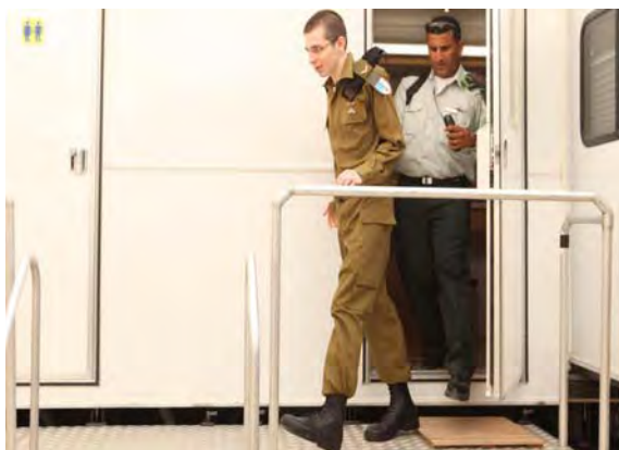
Gilad Shalit in an IDF uniform after arriving at an army base near the Kerem Shalom crossing (IDF Spokesman's Website, October 18, 2011).