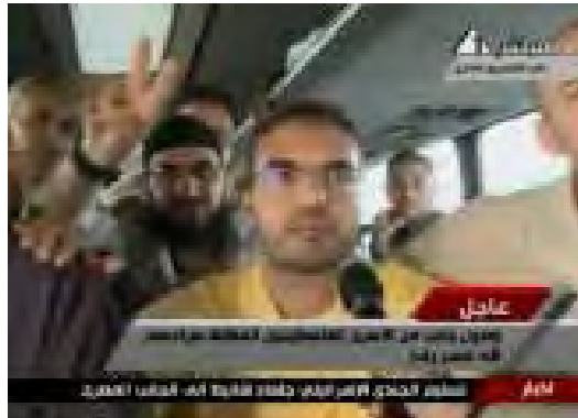
Terrorists interviewed by Egyptian TV en route to the Gaza Strip (Egyptian TV, October 18, 2011).

the Gaza Strip they thanked Hamas and Egypt for their release. Some of them called for more Israelis to be abducted and used to obtain the release of more prisoners in Israeli jails.