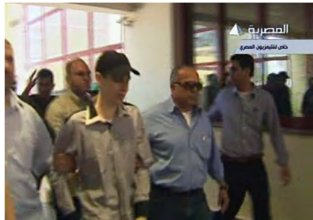
Gilad Shalit led by his captors to the Rafah crossing (Egyptian TV, October 18, 2011). To his right is Ahmed Jaabari, commander of Hamas' military-terrorist wing, who personally handed him over to the Egyptian authorities.