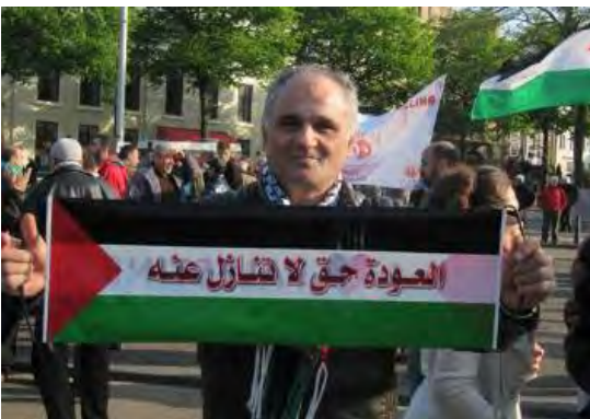
Participant at a PPMS demonstration holding a sign emphasizing the Palestinian refugees' "right of return" to Israel

5. After the termination of Al-Aqsa Foundation's activities in the Netherlands, Amin Abu Rashed changed his modus operandi and became the leader of a local group called PPMS (Palestinian Platform for Human Rights and Solidarity) operating in the Netherlands. It is a pro-Hamas organization affiliated with the Muslim Brotherhood , established in late 2005 and considered the most vociferous organization of its kind in the Netherlands (ibloga.blogspot.com, nisnews.nl).