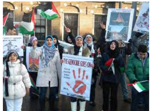
Pro-Hamas demonstration for Gaza accusing Israel of genocide