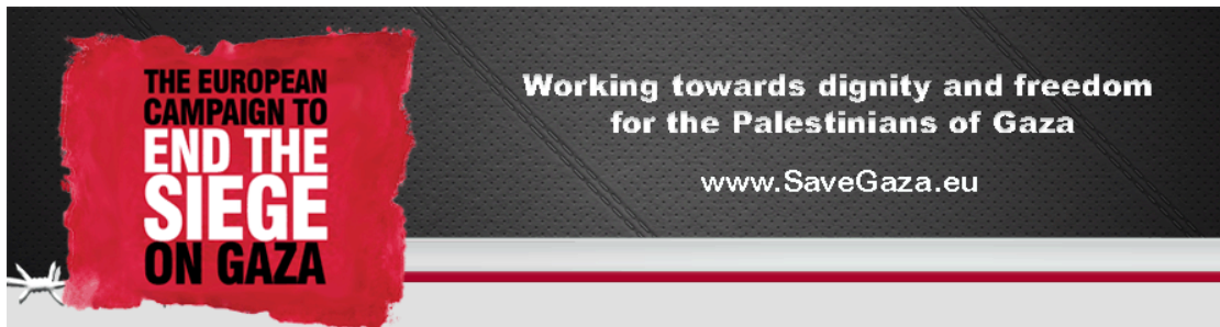
The ECESG logo