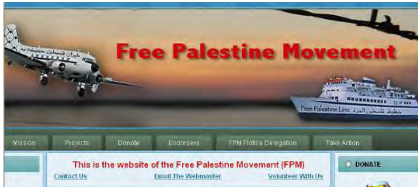
The masthead of the FPM's homepage (Free Palestine website, August 22, 2010).

1. The FPM is a non-profit American organization based in California which describes itself as a "non-profit human rights organization." It has a number of groups operating throughout the United States. According to its claims, its mission is to challenge Israeli policy, which it claims "denies the Palestinians human rights," especially the right of free movement. It claims to be trying to achieve its ends through "non-violent resistance." The FPM and other pro-Hamas organizations like it often represent themselves as non-violent, while in reality they are ready to use strong violence against the Israeli security forces.