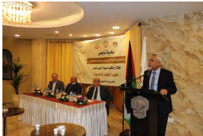
Moussa Shakarneh participating in the opening ceremony of the office of the Land Settlement Authority in the Nablus District with the participation of Nablus District Governor Akram Rajoub and Nablus Mayor Adly Yaish (Facebook page of the Land and Water Settlement (Registration) Authority, November 21, 2017).