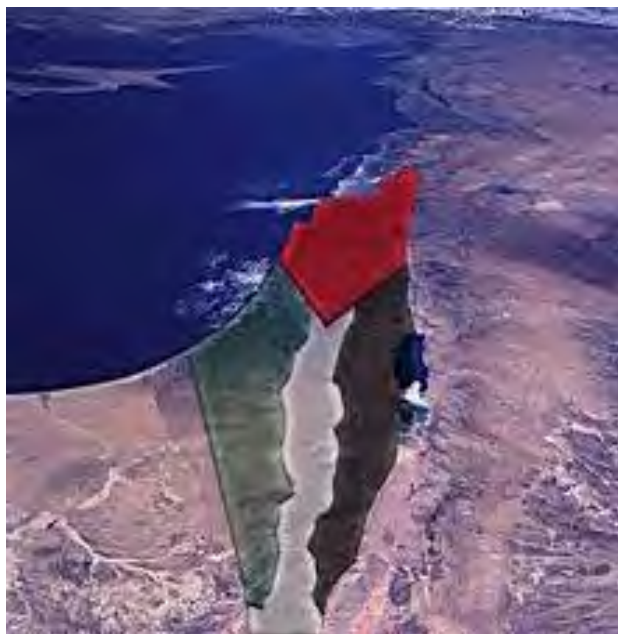
Profile photo on the official Facebook page of the Land and Water Settlement (Registration) Authority. The Palestinian flag is marked on the map of Palestine, conveying the message that the entire Land of Israel belongs to the Palestinians (Facebook page of the Land and Water Settlement (Registration) Authority, October 11, 2016)