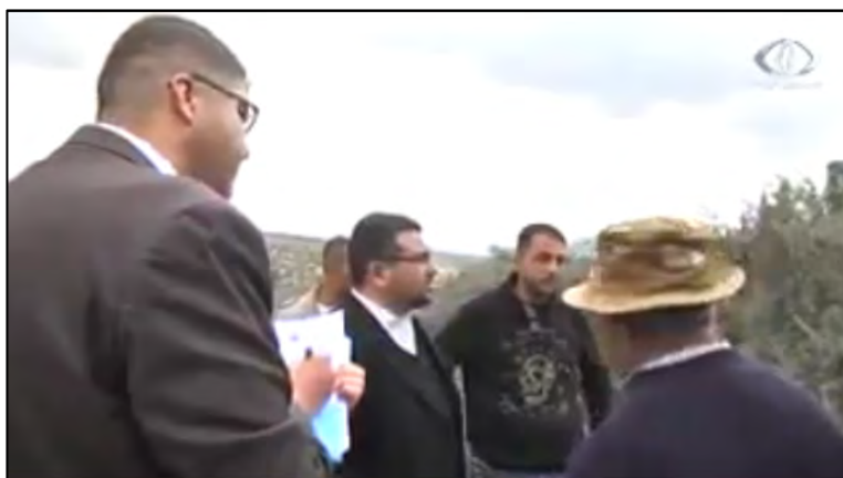
A team from the Land and Water Settlement (Registration) Authority meeting with residents of the village of Kharbatha Al-Misbah, west of Ramallah, to map and register their land