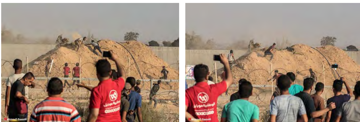
Palestinians who infiltrated into an IDF sniper post in eastern Rafah take equipment from the post.