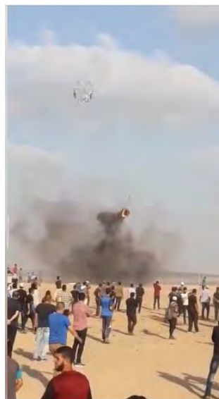
A kite with a burning tire launched from eastern Gaza City (Facebook page of the "supreme national authority of the return march," August 3 and 5, 2018).