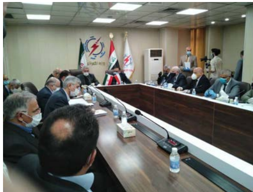
The meeting between the Iranian minister of energy with the Iraqi minister of electricity