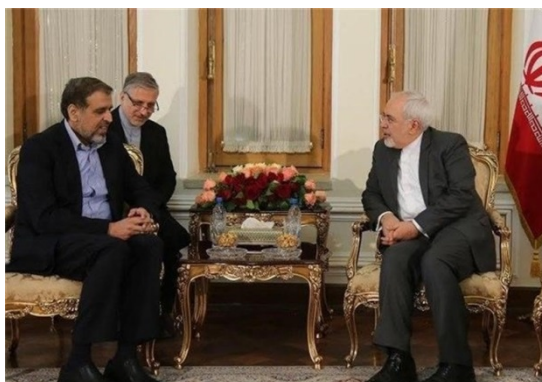
The meeting between the Iranian Minister of Foreign Affairs, Zarif, with Ramadan Shallah in Tehran in May 2016 (Tasnim, June 7, 2016).

► Senior Iranian officials issued condolence notices following the passing of the former Secretary General of Palestinian Islamic Jihad, Ramadan Shalah. In a statement issued by the Supreme Leader of Iran, Ali Khamenei, he stated that the “Palestinian resistance” lost “an important element.” Khamenei expressed hope that Jihadi efforts of his predecessors will be able to compensate for the loss (Tasnim, June 8). The Iranian Minister of Foreign Affairs, Mohammad Javad Zarif, praised the role Shalah played in the Palestinian “resistance” against the “Zionist regime” in a statement he issued. He also lauded Shalah’s role in bolstering the unity of the Palestinian people and the Muslim world. He proclaimed that in the conscience of the people, and particularly the people of Palestine and Iran, Shalah will remain a symbol of resistance and struggle (Tasnim, June 7).