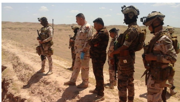
Iraqi security forces locating ISIS's IEDs (Iraqi Defense Ministry, June 21, 2020)