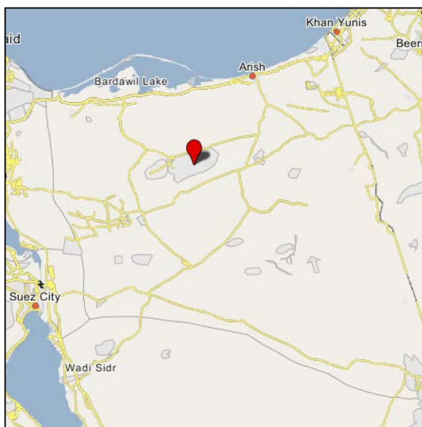
Jabal al-Maghara (Wikimapia)

► On June 21, 2020 , operatives of ISIS's Sinai Province attacked Egyptian army forces near Jabal al-Maghara , in Central Sinai (about 60 km southwest of Al-Arish). A total of 15 soldiers were killed or wounded (Telegram, June 21, 2020). According to reports by local sources, six soldiers were killed in the attack and three others were wounded . According to the reports, the Egyptian Air Force was operating in the area (Shahed Sinaa al-Rasmiyah Facebook page, June 21, 2020).