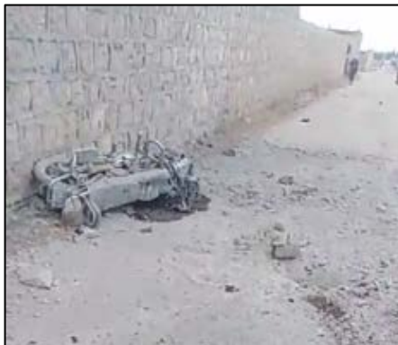
The motorcycle on which the two ISIS senior commanders were riding (Khotwa, June 20, 2020)