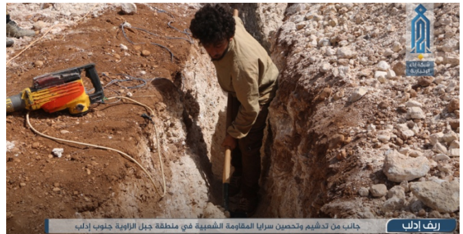
Operatives of the Headquarters for the Liberation of Al-Sham during fortification work (Ibaa, June 19, 2020)