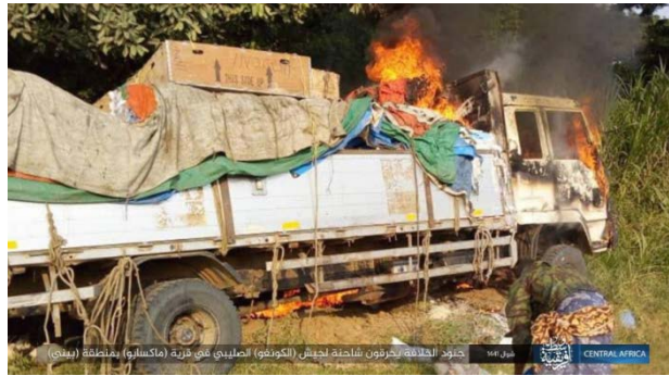
Truck used by the Congolese army going up in flames after being targeted by ISIS machine gun fire (Isdarat, June 21, 2020)