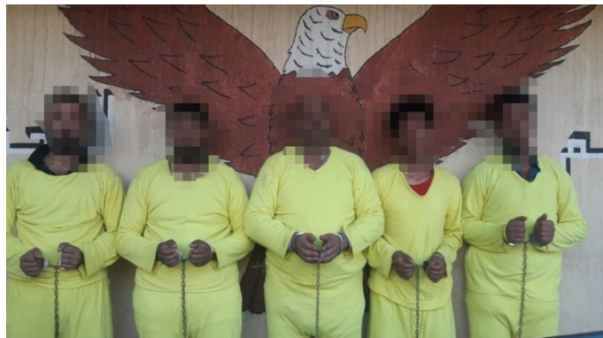
Five ISIS operatives captured by the Intelligence Directorate force (Al-Sumaria, June 20, 2020)

► On June 20, 2020 , an Intelligence Directorate force captured five ISIS operatives operating in the Al-Anbar Province. Under interrogation, they admitted having abducted and killed several residents in the Al-Anbar Desert. Subsequently, the bodies of the residents were located in the desert area of Al-Rutba (Al-Sumaria, June 20, 2020).