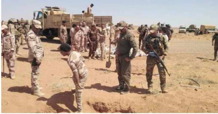
A joint force of the Popular Mobilization and the Iraqi army during security activity against ISIS

► On June 20, 2020 , an Intelligence Directorate force captured five ISIS operatives operating in the Al-Anbar Province. Under interrogation, they admitted having abducted and killed several residents in the Al-Anbar Desert. Subsequently, the bodies of the residents were located in the desert area of Al-Rutba (Al-Sumaria, June 20, 2020).