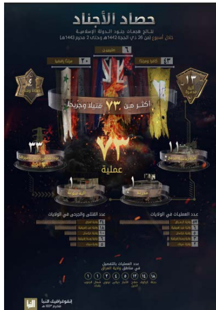
The infographic detailing ISIS's activity (Al-Naba' weekly, Telegram, August 12, 2021)

in the following provinces: West Africa (18); Khorasan, i.e. Afghanistan (10); Central Africa (6); Sinai (5) (Al-Naba' weekly, Telegram, August 12, 2021).