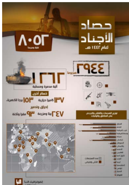
Infographic summing up ISIS’s activity around the world over the past year (Al-Naba’ weekly, Telegram, August 12, 2021)

casualties in other countries and regions, as follows: India (10), Libya (9), Indonesia (7), Tunisia (6), Hejaz (i.e., Saudi Arabia) (4) and the Caucasus (2) (Al-Naba' weekly, Telegram, August 12, 2021).