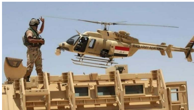
Iraqi army helicopter and armored vehicle during security activity (Al-Sumaria, August 17, 2021)

▶ The Iraqi Defense Ministry announced that Iraqi military aircraft supporting the security forces had killed two ISIS operatives in the province (Al-Sumaria, August 17, 2021).