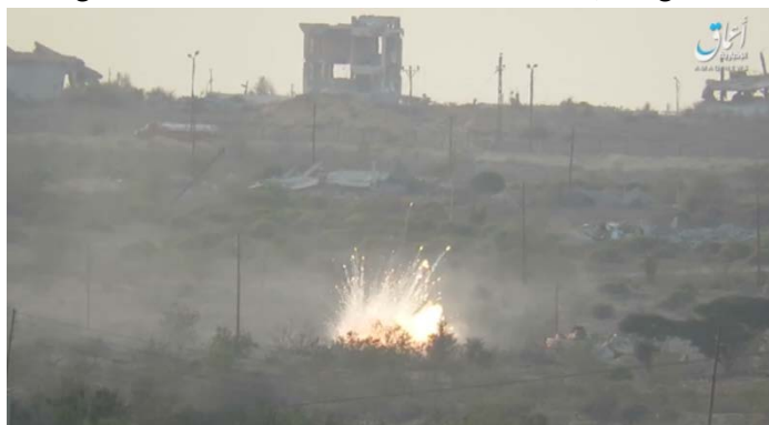
Egyptian army armored vehicle going up in flames following an IED explosion (Amaq video posted on Telegram, August 15, 2021)

► On August 12, 2021 , an IED was activated against an Egyptian army vehicle west of New Rafah. The passengers on board were killed or wounded (Telegram, August 12, 2021).