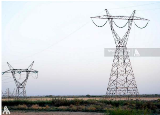
High-voltage pylons in Iraq (Iraqi News Agency, August 17, 2021)