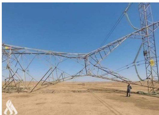
High-voltage pylon sabotaged by ISIS