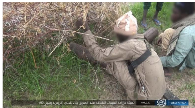
Right: ISIS operative planting one of the IEDs against the Nigerian army. Left: Nigerian army forces being targeted by gunfire (Telegram, August 17, 2021)