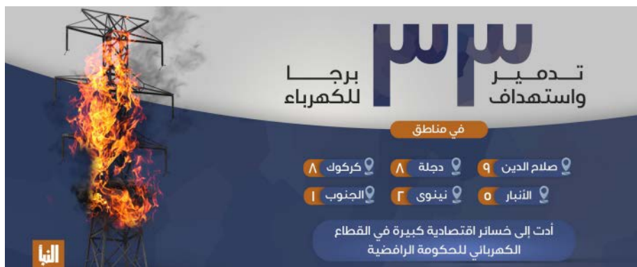
ISIS infographic about recent damage to high-voltage pylons (Al-Naba' weekly as posted on Telegram, August 12, 2021)

► ISIS's Al-Naba' weekly published this week an infographic detailing the scope of the economic war waged by ISIS against the Iraqi government. According to the infographic, 33 high-voltage pylons were destroyed or hit throughout Iraq. The following are details by province: nine in the Salah al-Din Province; eight in the Dijla (Tigris) Province; eight in the Kirkuk Province; five in the Al-Anbar Province; two in the Nineveh Province; and one in the Janub (South) Province. The infographic notes that the Iraqi government sustained heavy losses due to this activity (Al-Naba' weekly as posted on Telegram, August 12, 2021).