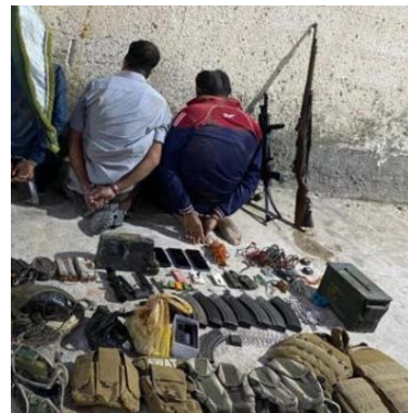
Right: Detained ISIS operatives and some of the weapons found in their possession. Left: IEDs and equipment found in their possession

▶ Helicopter-borne forces of the Global Coalition against ISIS, with the assistance of SDF counterterrorism units, detained a senior ISIS commander in the Mahaimida region, about 10 km north of Deir ez-Zor. He had been in charge of the activity of ISIS squads and communication between them in northern and eastern Syria and on the Syrian-Iraqi border. Large quantities of explosives, weapons and documents were seized (SDF Press, August 15, 2021).