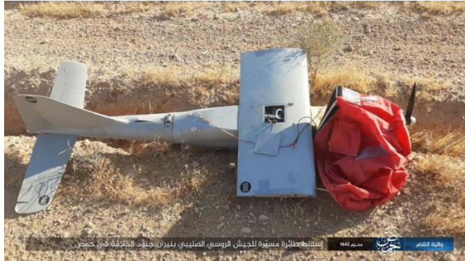
The wreckage of a Russian UAV which, according to ISIS, was shot down in the Homs Desert (Telegram, August 15, 2021)

▶ A Russian UAV was shot down by machine gun fire in the Homs Desert (Telegram, August 15, 2021).