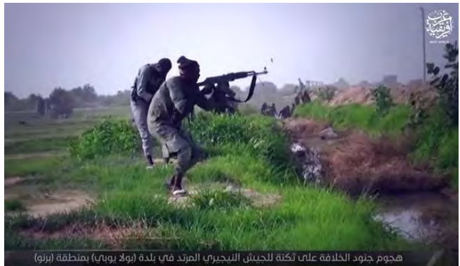
Right: Documentation of an attack against the Nigerian army. Left: Preaching among the residents (Telegram, June 14, 2022)