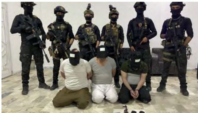
Three squad members detained in Al-Hawl (SDF PRESS, June 12, 2022)