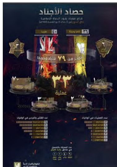
Summary of ISIS attacks (Al-Naba weekly, Telegram, June 9, 2022)

► The infographic indicates that ISIS's activity was similar to that of the previous week, except for Syria, where no activity was recorded.