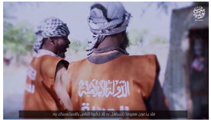
Right: The activity of ISIS's morality police. Left: Distribution of financial aid to the residents in an attempt to garner support (Telegram, June 14, 2022)