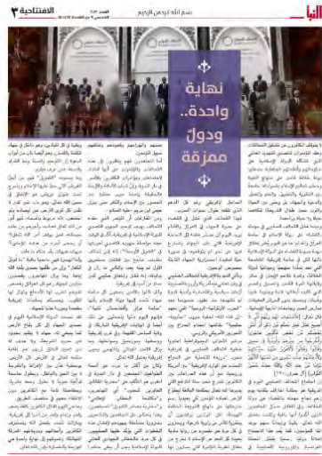
The text of the article (Al-Naba weekly, Telegram, June 9, 2022)