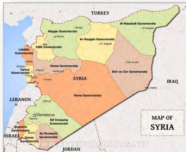
Map of the Syrian provinces