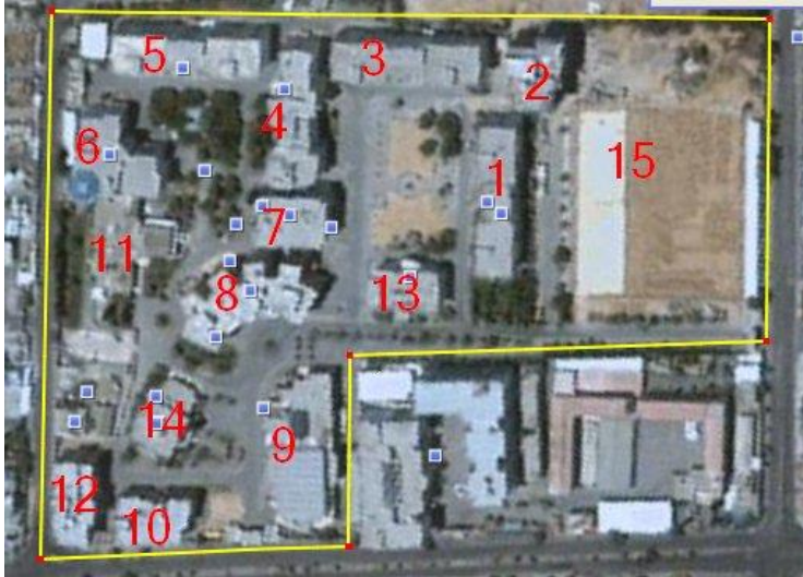
Aerial photograph of the Islamic University of Gaza. Building number 4 (highlighted at the list on the right) houses the laboratories (List from the Islamic University's student forum website). The laboratories developed weapons for Hamas.