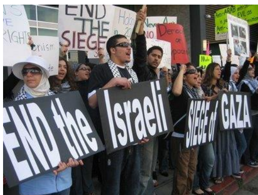
Pro-Palestinian students at the LSE demonstrating against Israel.

propaganda and incitement, and initiatives for academic boycotts of Israel and Israeli universities. In recent years many universities in Britain have become hotbeds of radical leftist and Islamic activity , including Hamas, which has a broad support base in Britain. 5 In dealing with the universities, Hamas has managed to conceal its radical Islamic-totalitarian features (such as its de facto negation of individual freedom, democracy and human rights, and its anti-Western, anti-liberal, anti-Semitic ideology).