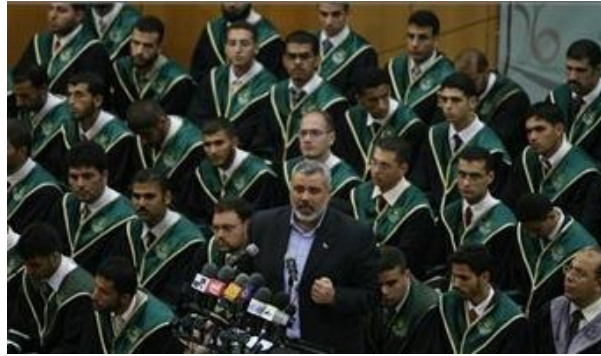
Ismail Haniya speaks at the Islamic University of Gaza

A) Ismail Haniya , head of the de facto Hamas administration, has a degree in Arabic literature from the university.