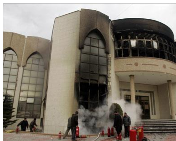
Fire at the university during the violent struggle between Fatah and Hamas in May 2007 ( Dunia Al-Watan , May 15, 2007).

9. The university, beyond being an integral part of Hamas' terrorist infrastructure, is also a center for radical Islamic brainwashing and indoctrinating students with the