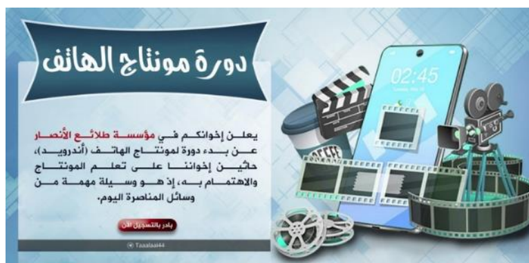
The announcement on the digital editing course (Telegram, February 5, 2023)

► On February 5, 2023, the ISIS-affiliated Tala'e al-Ansar (“Pioneer Supporters”) media foundation published an announcement that it is opening a digital editing course for ISIS propaganda materials (apparently including video, audio, and photo editing), adapted for cell phones. The announcement calls on the organization’s supporters to hurry up and join the course, noting that learning how to edit is an important tool for helping ISIS in its media efforts (Telegram, February 5, 2023). The course is to open apparently in an attempt to strengthen ISIS’s propaganda network.