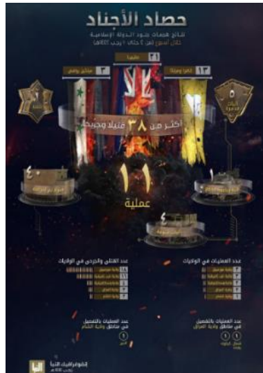
Summary of ISIS’s attacks (Al-Naba, Telegram, February 2, 2023)