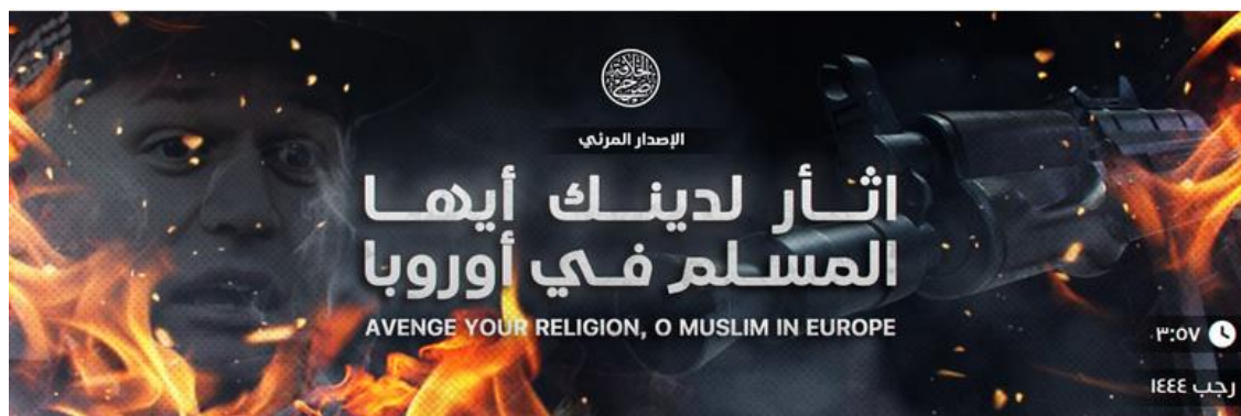
The title of the video, “Avenge Your Religion, O Muslim in Europe,” with flames, a gun, and the photo of Rasmus Paludan in the background (Telegram, February 3, 2023)