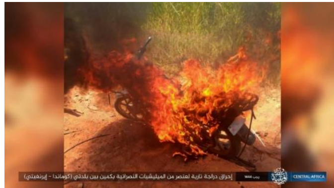
A motorcycle on fire in the Ituri region, in northeastern Congo, after ISIS operatives had killed the citizen riding on it (Telegram, February 5, 2023)