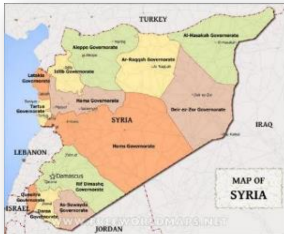
Map of Syria's provinces (freeworldmaps.net)