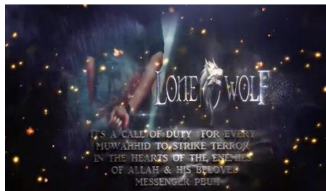
A call for carrying out lone-wolf attacks and violent jihad, with a photo of Rasmus Paludan in the background (Telegram, February 3, 2023)