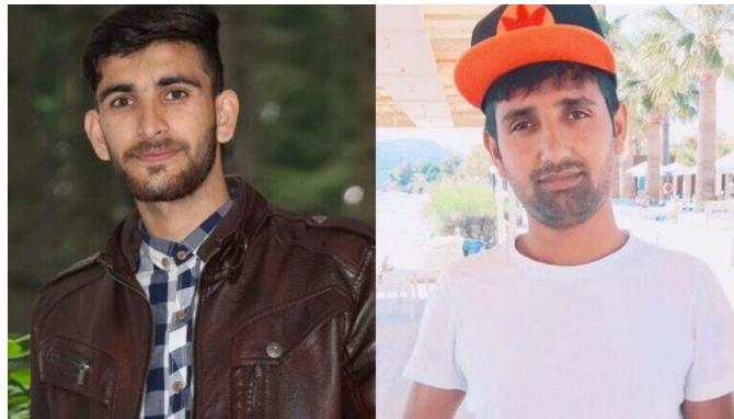
Two Pakistanis suspected of planning the terrorist attack at the direction of Iran (Greek media, March 29, 2023).

► The Iranian embassy in Athens denied the reports. On March 29, 2023, the embassy tweeted the claim that the reports were "baseless accusations against Tehran," and that "the fabricated claims were meant to deflect attention from the internal crises of the Zionist entity."