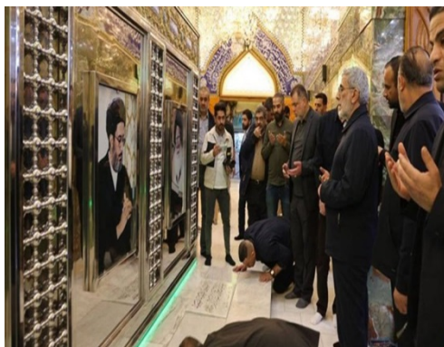
Esmail Ghaani in Iraq.