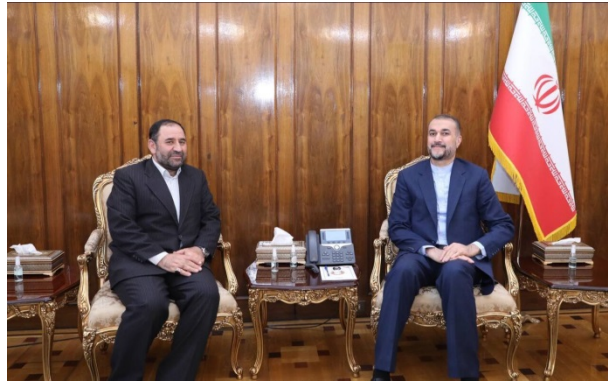
The incoming Iranian ambassador to Damascus meets with the Iranian foreign minister (IRNA, March 27, 2023).