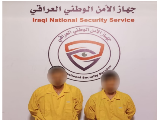
Two ISIS operatives detained in the Kirkuk province (Iraqi News Agency, April 22, 2023)

detained had previously detonated an IED against an Iraqi police patrol and threw a hand grenade at a police vehicle, killing a policeman. He also opened a guesthouse for ISIS squad members in the Laylan area, about 10 km southeast of Kirkuk (Iraqi News Agency, April 22, 2023).