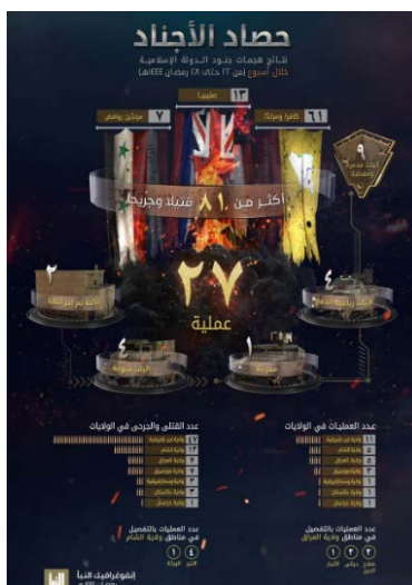
Summary of ISIS attacks (Al-Naba weekly, Telegram, April 20, 2023)