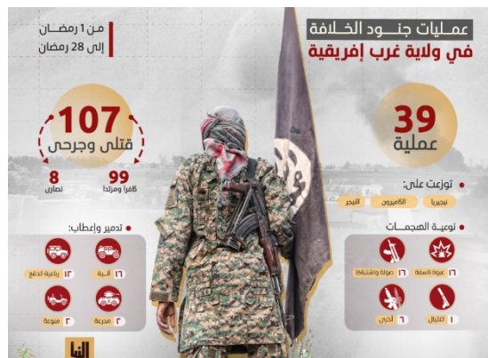
Summary of the activity of ISIS's West Africa Province during Ramadan (Al-Naba, Telegram, April 20, 2023)

destroyed or put out of commission 16 vehicles, 12 off-road vehicles, two armored vehicles, and two other vehicles (Al-Naba, Telegram, April 20, 2023).