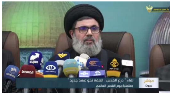
Hashem Safi al-Din, chairman of Hezbollah's Executive Council (al-Manar, April 12, 2023).

► Hashem Safi al-Din, chairman of Hezbollah's Executive Council , claimed the "[resistance] axis" had united the "resistance" and that the objective remained the same, to destroy the State of Israel . He said their capabilities were becoming strong and every order given by [Israeli Prime Minister] Netanyahu would be responded to by all the fronts (al-Manar, April 12, 2023).