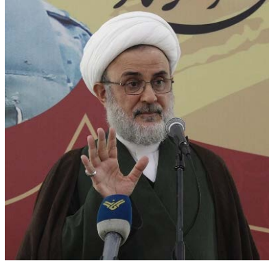
Nabil Qaouq (al-Manar, April 17, 2023).

actions carefully before it thought to begin a war against Lebanon, which had become the country the most "immune" to an Israeli threat (al-Manar, April 9 and 17, 2023).