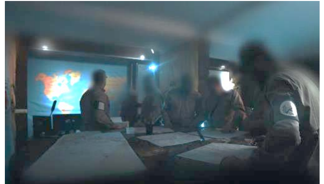
Inside the joint operations room: operatives with Hamas, the Fatemiyoun Brigades and Hezbollah patches on their sleeves (Telegram, April 13, 2023).