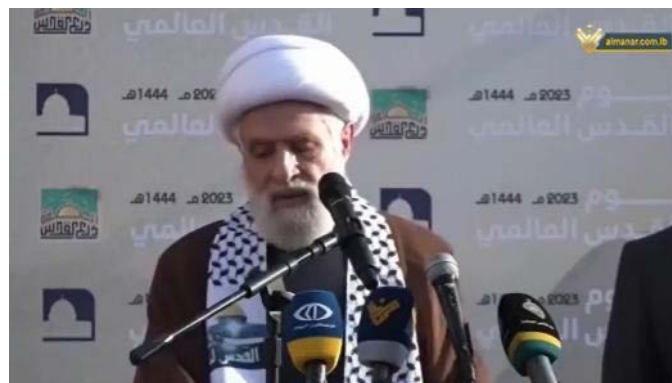
Na'im Qasim delivering his speech (al-Manar, April 16, 2023)