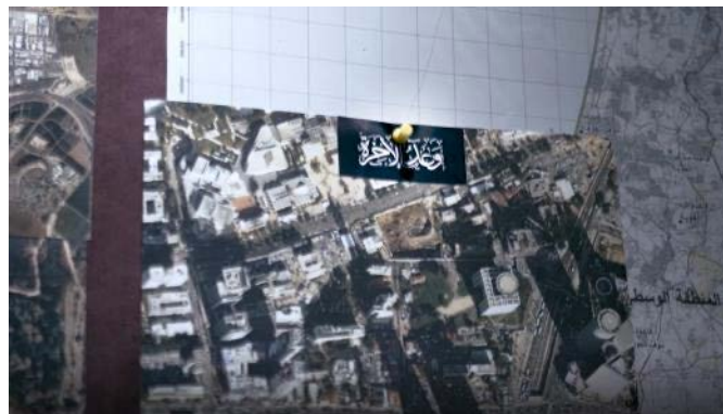
Right: A map of the Kirya in Tel Aviv, the seat of the Israeli defense establishment. The Arabic reads, "The promise of Judgment Day." Left: The end of the video, reading "Prepared" in Arabic and Hebrew (Telegram, April 13, 2023).