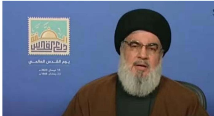
Hassan Nasrallah delivering his speech.

crisis. He also claimed that in light of the current situation Israel would not last until its 80 th year. He warned Israel that its responses or "foolish actions" in Jerusalem, Judea, Samaria, the Gaza Strip, Lebanon or Syria could drag the entire Middle East into war, and promised Hezbollah would respond to any attack on Lebanon.