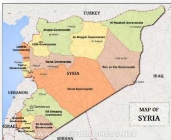
Syria's provinces (Free world maps)