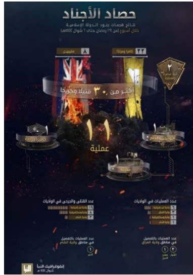
Summary of ISIS attacks (Al-Naba weekly; Telegram, April 27, 2023)

number of casualties (19). Other dead and wounded: Central Africa (8); Syria (3) (Al-Naba weekly; Telegram, April 27, 2023).