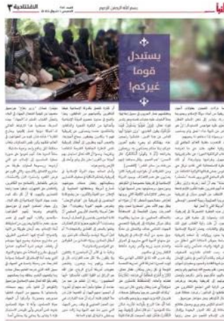
The article: “[Allah] has replaced you with another people [to continue jihad]” (Al-Naba weekly, Telegram, May 4, 2023)