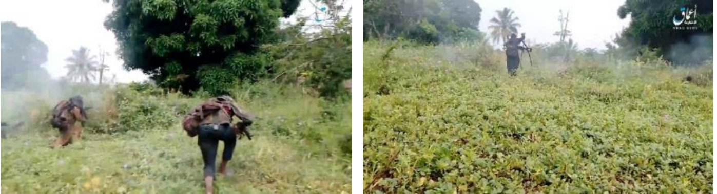
ISIS operatives attack a Mozambican army position (Telegram, May 6, 2023)

► On April 29, 2023, an attack was carried out against a Mozambican army position in the village of Mandaba, in Muidumbe, in the northeast of the country. At least five soldiers were killed and ten wounded in the heavy exchanges of fire between the sides (Telegram, May 3, 2023).