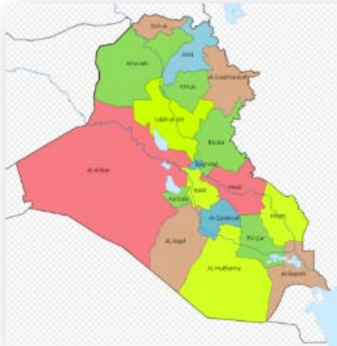
Provinces of Iraq (Wikipedia)