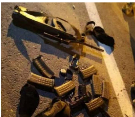
The rifle, magazines and handgun found at the scene of the attack (Al-Arabiya, May 9, 2023)