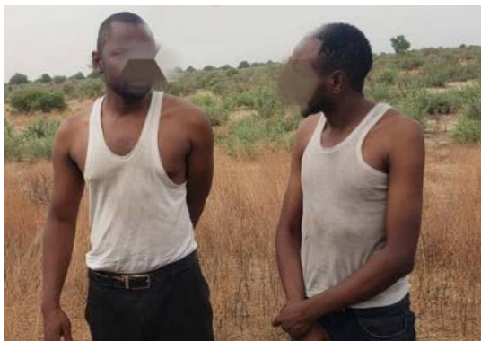
Two aid workers rescued by a Nigerian army force (Zagazola, May 4, 2023)