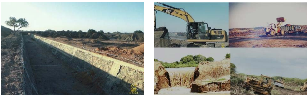
Documentation of the construction of the dam

► On May 5, 2023, Al-Kataeb, Al-Shabaab's propaganda arm, published photos documenting the construction of a dam in the Bay province in southern Somalia by members of the organization (Al-Shabaab's Shahada News Agency, May 5, 2023). These photos could indicate that despite efforts by the Somali government and the United States to eliminate the group's presence, it still has control over areas in the south of the country.