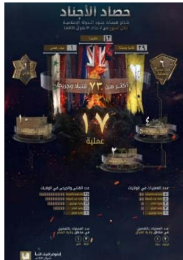
Summary of ISIS attacks (Al-Naba weekly; Telegram, May 4, 2023)

number of attacks was carried out by the Central Africa Province (5). Attacks carried out in other provinces: West Africa (5); Syria (3), Iraq (3); and Mozambique (1). A total of 73 people were killed and wounded in the attacks, compared with 30 in the previous week. The largest number of casualties was in the Central Africa Province (25). Other dead and wounded: West Africa (19); Mozambique (17); Syria (11); and Iraq (1) (Al-Naba weekly, Telegram, May 4, 2023)