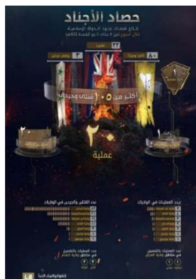
Summary of ISIS attacks (Al-Naba weekly, Telegram, June 1, 2023)

► According to an infographic published by Al-Naba, ISIS's weekly, summarizing ISIS's activity in the period between May 25 and 31, 2023, ISIS operatives carried out 20 attacks in the various provinces during this period (compared with 16 the previous week). The West Africa Province carried out the highest number of attacks (7). Attacks carried out in the other provinces: Syria (4); Central Africa (3); Sahel (2); Iraq (2); Khorasan, i.e., Afghanistan (1); and Mozambique (1). A total of 105 people were killed and wounded, compared with 57 in the previous week. The largest number of casualties was in the Sahel Province (52). The rest of the casualties: Central Africa (21); West Africa (16); Syria (11); Iraq (3); Khorasan, i.e., Afghanistan (1); and Mozambique (1) (Al-Naba weekly, Telegram, June 1, 2023).