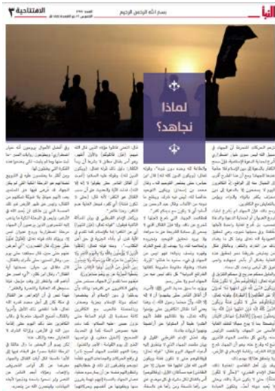
The article “Why do we carry out jihad?” (Al-Naba weekly, Telegram, June 1, 2023)

the “infidels” who do not accept Islam by choice. The writer adds that ISIS does not fight the “infidels” solely because of their hostility towards Islam and not only because of the theft of Muslim resources and lands but out of a genuine religious commitment to impose Islam in the world (Al-Naba weekly, Telegram, June 1, 2023).