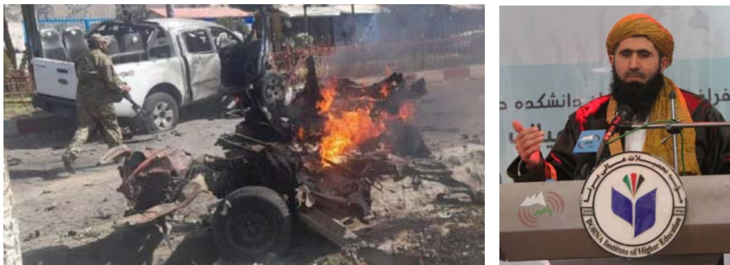
Right: Deputy governor of Badakhshan Province, Nizar Ahmad.