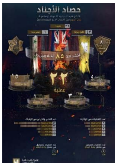
Summary of ISIS attacks (Al-Naba weekly, Telegram, June 8, 2023)

►According to an infographic published by ISIS's weekly Al-Naba, summarizing ISIS's activity in the period June 1-7, 2023, ISIS operatives carried out 22 attacks in the various provinces during this period (compared with 20 in the previous week). The West Africa Province carried out the highest number of attacks (9). Attacks carried out in the other provinces: Central Africa (8); Khorasan, i.e., Afghanistan (3); Syria (1); and Iraq (1). A total of 85 people were killed and wounded in the attacks. This compares with 105 people the week before. The largest number of casualties was in the West Africa Province (42). Casualties in the other provinces: Central Africa (32); Khorasan, i.e., Afghanistan (6); Syria (4); and Iraq (1) (Al-Naba weekly, Telegram, June 8, 2023)