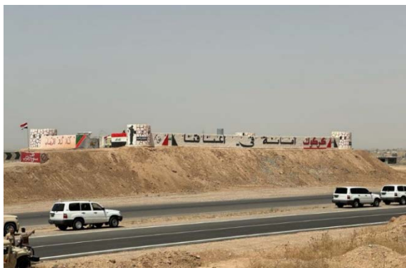
The Iraqi army compound attacked by ISIS (Iraqi News Agency, June 11, 2023)