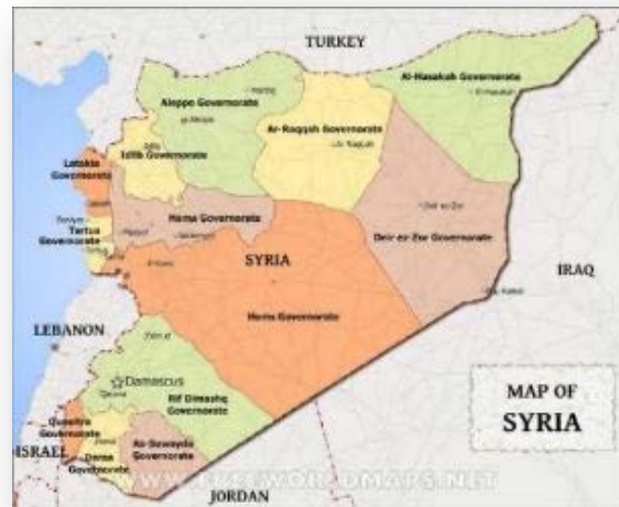
Provinces of Syria (Free World Maps)