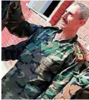
Brigadier General Ali al-Akhras