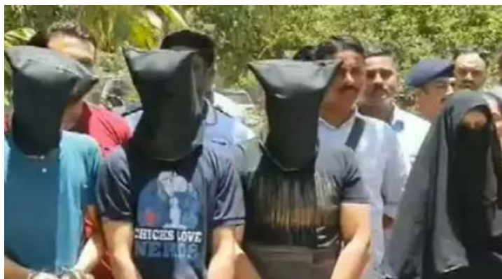
Three men and one woman, affiliated with ISIS’s Khorasan Province, detained in the Indian state of Gujarat The Times of India, June 10, 2023)