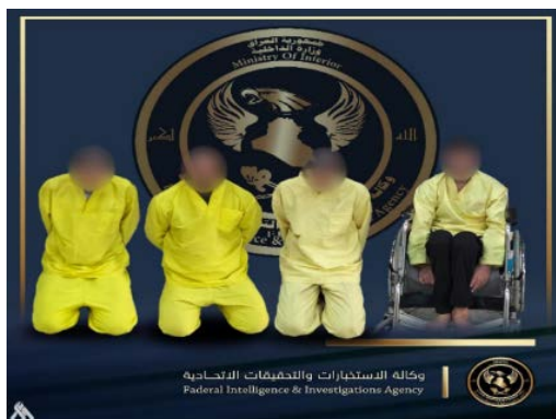
Four ISIS operatives who were detained (Iraqi News Agency, June 7, 2023)