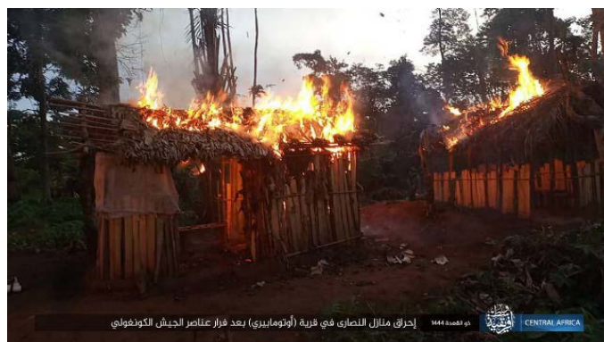
Houses of Christian civilians set on fire by ISIS (Telegram, June 13, 2023)