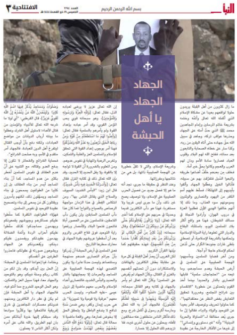
The editorial entitled “Jihad, Jihad, O People of Ethiopia” (Al-Naba weekly, Telegram, June 8, 2023)

►The editorial of ISIS’s weekly Al-Naba was published this week under the title, “Jihad, Jihad, O People of Ethiopia.” The article attempts to leverage the tension between Christians and Muslims in the country to encourage Ethiopian Muslims to join ISIS and wage jihad against the “infidels.” According to the author, Muslims in Ethiopia suffer from the persecution of Christians (“Crusaders”), which is expressed in violence, discrimination, and destruction of mosques. He stresses that secular ideologies far from Islam would not help them, calling on them to adhere to jihadist Islam and join ISIS’s training camps in East Africa (Al-Naba weekly, Telegram, June 8, 2023).