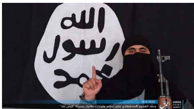
The terrorist who carried out the suicide bombing attack (Amaq, Telegram, June 9, 2023)