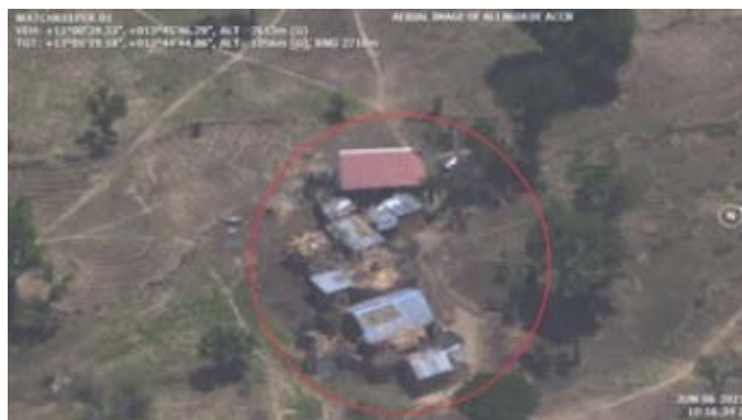
Camp of Ali Ngulde, the target of the airstrike (Zagazola, June 10, 2023)