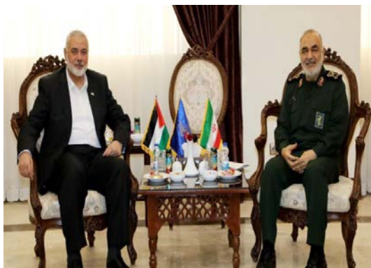
Isma'il Haniyeh (left) and Hossein Salami (Palinfo, June 21, 2023).

► On June 21, 2023, the Hamas delegation met with Hossein Salami, the IRGC commander. They discussed political developments in the Palestinian, regional and international arenas. They both stressed that Palestinian and Islamic unity was the only way to defeat the Zionist occupation, and that they would continue cooperating in a way that would serve every aspect of the "resistance" (palinfo.com, June 21, 2023).