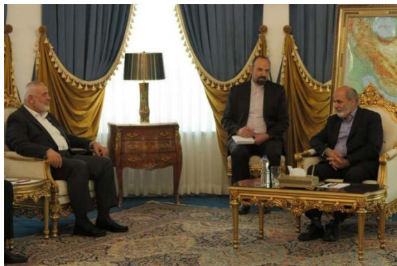
The Hamas delegation meets with the secretary of Iran's Supreme National Security Council (right). Haniyeh sits facing him.

► On June 21, 2023, the Hamas delegation met with Hossein Salami, the IRGC commander. They discussed political developments in the Palestinian, regional and international arenas. They both stressed that Palestinian and Islamic unity was the only way to defeat the Zionist occupation, and that they would continue cooperating in a way that would serve every aspect of the "resistance" (palinfo.com, June 21, 2023).