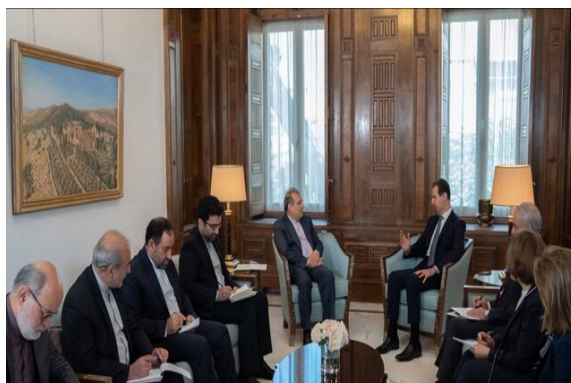
President Assad meets with the Iranian foreign minister's senior advisor.