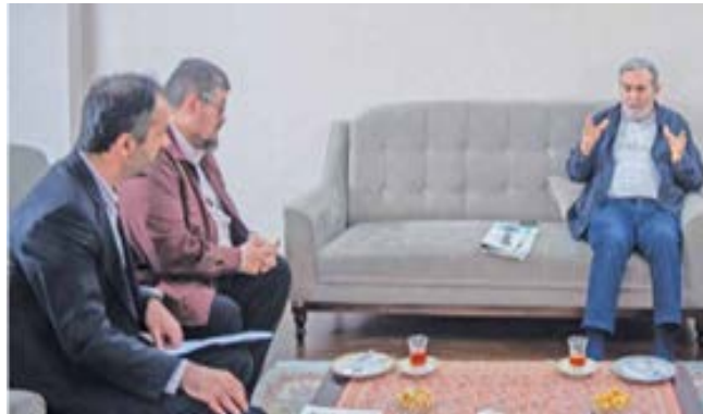
Ziyad al-Nakhlah interviewed by the government newspaper Iran (July 2, 2023).

overstated, and that the most important assistance from Iran was in the military-security domain. He added that the strong relations with the Islamic Republic persisted despite the targeted killing of Qassem Soleimani, commander of the IRGC's Qods Force, and that both Soleimani and Esmail Qaani represented the Islamic Republic's unwavering support for the Palestinians. He said the ties with Iran would remain strong despite pressures from the Arab governments to sever them.