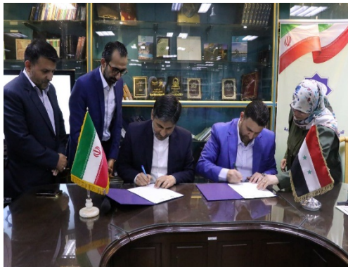
Signing the agreement for bilateral youth cooperation (IRNA, June 25, 2023).

agreement for bilateral youth cooperation in the fields of culture, science, education, and higher education (IRNA, June 25, 2023).