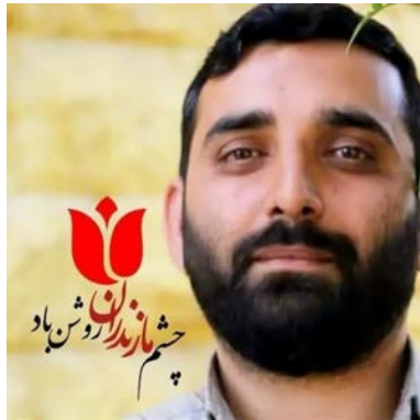
IRGC officer Mehdi Akbarpour, killed in Syria (Tasnim, July 8, 2023).

► On July 8, 2023, the Iranian media reported the death of IRGC officer Mehdi Akbarpour in Syria. According to the reports, he died on July 6, 2023, after having been wounded in an undated attack in Syria attributed to Israel (Tasnim, July 8, 2023).