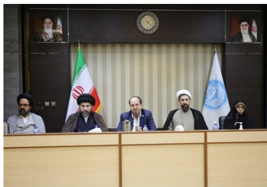
The Iraqi delegation at Tehran University (Tasnim, July 8, 2023).