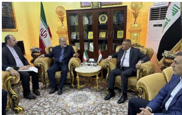
Meeting of the Iranian and Iraqi foreign ministers (ISNA, July 8, 2023).