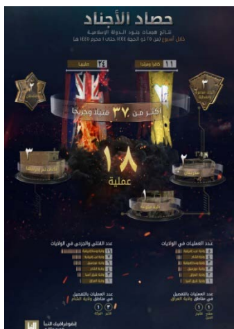
Summary of ISIS attacks (Al-Naba weekly, Telegram, July 20, 2023)