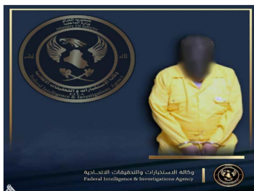
ISIS operative detained in the Diyala Province (Iraqi News Agency, July 25, 2023)

▶ On July 25, 2023, an Iraqi intelligence force and security forces detained an ISIS operative in the Diyala Province (the exact location was not specified). The operative, described as “dangerous,” took part in transferring weapons and money to ISIS operatives and was also involved in organ trafficking (Iraqi News Agency, July 25, 2023).