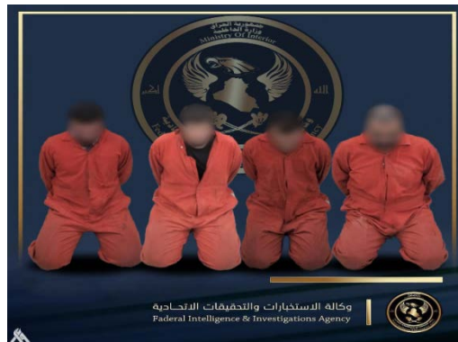
Four ISIS operatives detained in the Nineveh Province (Iraqi News Agency, July 20, 2023)

▶ On July 20, 2023, a force of the Iraqi National Intelligence Agency detained four ISIS operatives (the exact location was not specified). The four admitted their affiliation with ISIS and having operated in its ranks (Iraqi News Agency, July 20, 2023).