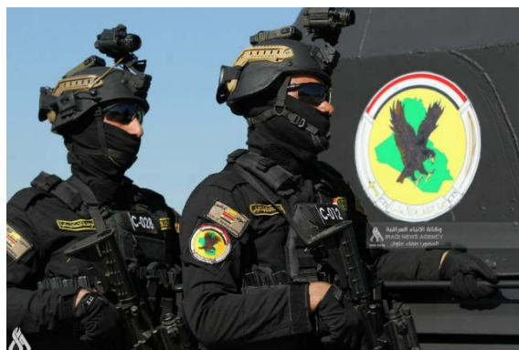
Members of the Iraqi Counterterrorism Unit (Iraqi News Agency, July 23, 2023)

▶ On July 23, 2023, a force of the Iraqi Counterterrorism Unit detained two wanted ISIS operatives (the exact location was not specified). In addition, seven ISIS guesthouses were destroyed (Iraqi News Agency, July 23, 2023).