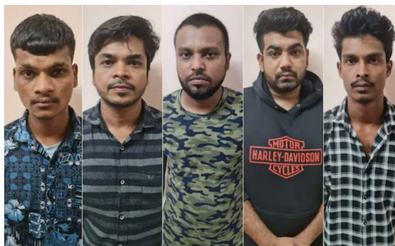
The five detainees in Bengaluru (NDTV, July 19, 2023)

▶ On July 19, 2023, an Indian police force arrested five suspected terrorist operatives in Bengaluru, southwest India. The five, residents of Bengaluru between the ages of 25 and 35, were planning to carry out attacks. Explosives, firearms, and daggers were found in their possession. Reportedly, this is not the first time that they have been arrested. In 2017, they were arrested in connection with a murder case, served a prison sentence of 18 months, and were released in 2019. The Indian police are looking for another person apparently residing outside India who has been behind the supply of weapons and explosives to the five detainees (NDTV, July 19, 2023). The organizational affiliation of the five detainees was not mentioned, but they may have been ISIS operatives.