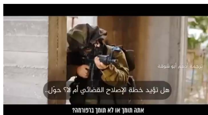
A scene from the video, with Arabic subtitles (al-Manar, July 24, 2023).