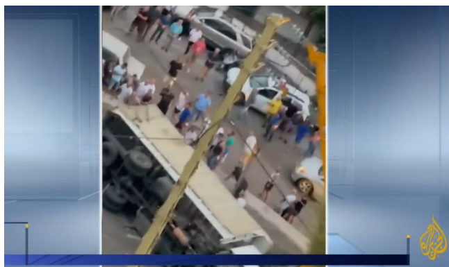
The Hezbollah weapons truck that overturned on its way to Beirut (al-Jazeera, August 9, 2023)