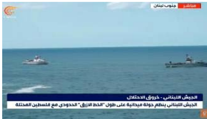
Documenting the Israeli Navy "violation" (al-Mayadeen, August 8, 2023)

waters by about 20 meters (about 22 yards, or 0.01 miles), thereby violating Lebanese sovereignty. Al-Mayadeen TV reported the Lebanese army had documented the incident (al-Mayadeen, August 8, 2023).