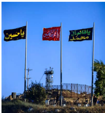
Shi'ite flags in front of an IDF post