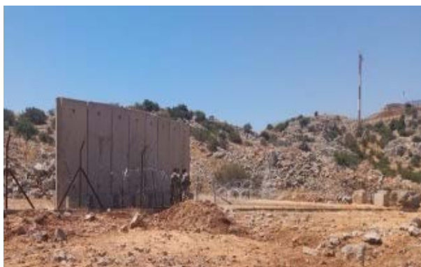
The wall built by Israel (al-Mayadeen, August 6, 2023)

► Al-Mayadeen TV reported that according to "Lebanese military sources," Israel had built a 10-meter wide wall in the Kafr Shuba area about three meters on the Lebanese side of the Blue Line (al-Mayadeen, August 6, 2023).