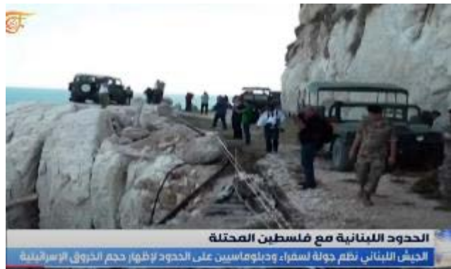
Diplomats tour the Israel-Lebanon border (August 8, 2023)

► According to reports, at the beginning of the tour the Lebanese army put its naval forces on alert facing IDF boats in the al-Naqoura region, claiming they had entered Lebanon's territorial