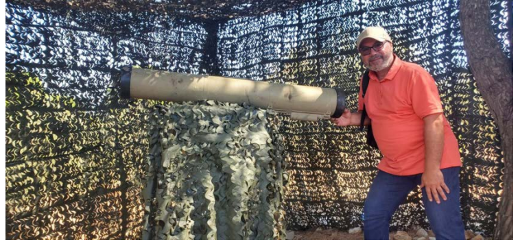
Journalists on the Israel-Lebanon border. Right: A picture next to a Kornet missile. Left: Looking at Israeli territory.

► On August 8, 2023, Lebanese army officers conducted a tour for 15 embassy representatives of UN Security Council members and showed them the disputed sites along the Lebanon-Israel border. The tour began in the area of Rosh HaNikra in the west and ended at the Shebaa Farms and Kafr Shuba in the east. A correspondent for the Hezbollah-affiliated al-Mayadeen network reported that the Lebanese army representatives explained to the diplomats and the accompanying media personnel about the 13 disputed points along the border, claiming Israel had to withdraw from them because they belonged to Lebanon (al-Mayadeen, August 8, 2023).