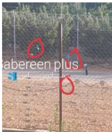
Cut electrical cables and an IED attached to the border security fence near Metulla (Sabrin Plus, August 19, 2023).

► On August 19, 2023, a pro-Iranian source reported that two electrical cables had been cut near Metulla and an IED attached to the border security fence between Israel and Lebanon (Sabrin Plus, August 19, 2023).