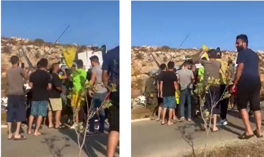
Lebanese youths confront a patrol of UNIFIL soldiers.

► On August 20, 2023, about ten Lebanese youths, apparently sent by Hezbollah, clashed with a patrol of UNIFIL soldiers in the al-Hiyam area, north of Metulla. A short time later the Lebanese left the area (al-Nashra, August 20, 2023; Ayman Shihadi's Twitter account, August 20, 2023).