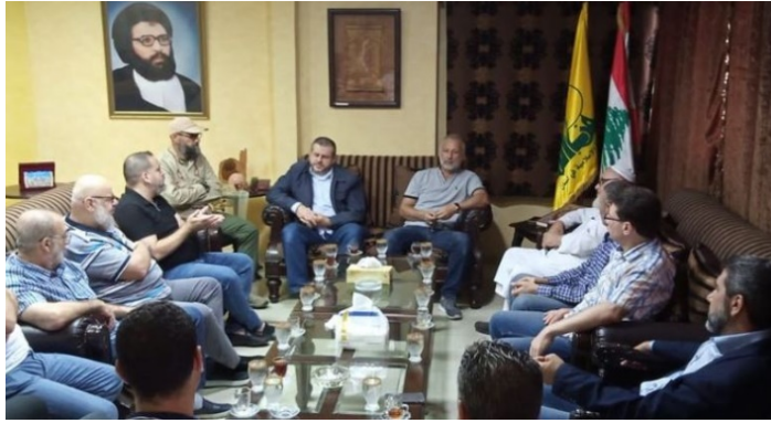
The delegations meet in Sidon (al-'Ahed, August 20, 2023)