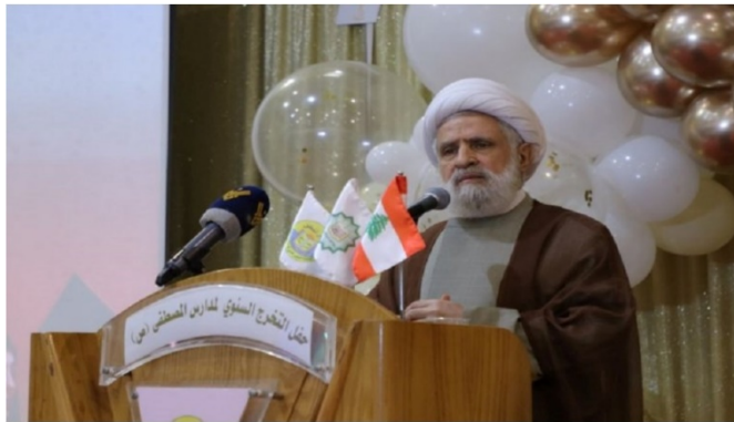
Na'im Qassem, Hezbollah deputy secretary general (al-Manar, September 16, 2023)

► Na'im Qassem, Hezbollah deputy secretary general , gave a speech at the graduation ceremony of Hezbollah's schools in Beirut in which he claimed the period when Israel could attack the Lebanese with impunity had ended. He said that anyone who criticized Hezbollah's military power was trying to hide his own political weakness in the [Lebanese] presidential elections. He also claimed anyone who demanded Hezbollah disarm was opening Lebanon's door to Israeli aggression (al-Manar, September 16, 2023).