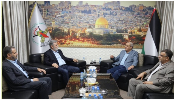
Al-Nakhalah meets with Jamil Mazher (Ziyad al-Nakhalah's Telegram channel, September 15, 2023)

► Mahmoud Abbas, chairman of the Palestinian Authority , met with Najib Mikati, prime minister of the Lebanese interim government , on the sidelines of the UN General Assembly in New York. They discussed Palestinian-Lebanese relations and the situation in Lebanon. Mahmoud Abbas emphasized his desire to achieve peace in the refugee camp in coordination with the Lebanese government (Wafa, September 19, 2023).