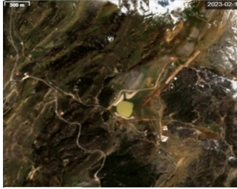
Sentinel Hub picture (@Lord Twitter account, September 15, 2023)