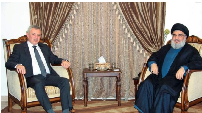
Hassan Nasrallah meets with Suleiman Frangieh (al-Jadeed TV, September 14, 2023)