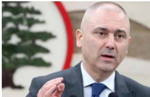
Elie Mahfoud, leader of the Change Movement Party (@lebanosnews Twitter account September 20, 2023)

◆ Elie Mahfoud, leader of the Change Movement Party , after meeting with Samir Geagea, leader of the Lebanese Forces Party , stated that Lebanon was the only country ruled by a cleric [Hassan Nasrallah] who obeyed the orders of a foreign country [Iran], and the cleric ran an armed organization [Hezbollah] working to construct an airport (@lebanosnews Twitter account September 20, 2023).