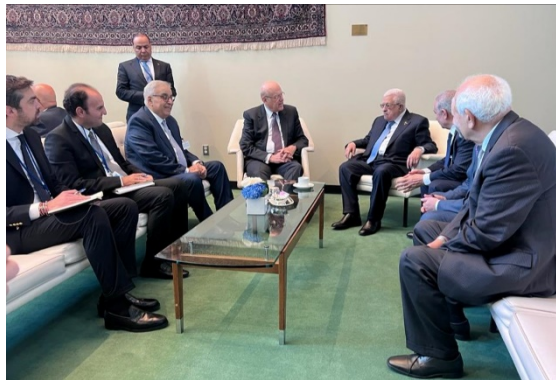
Mahmoud Abbas meets with Najib Mikati (Wafa, September 19, 2023)

► Mahmoud Abbas, chairman of the Palestinian Authority , met with Najib Mikati, prime minister of the Lebanese interim government , on the sidelines of the UN General Assembly in New York. They discussed Palestinian-Lebanese relations and the situation in Lebanon. Mahmoud Abbas emphasized his desire to achieve peace in the refugee camp in coordination with the Lebanese government (Wafa, September 19, 2023).