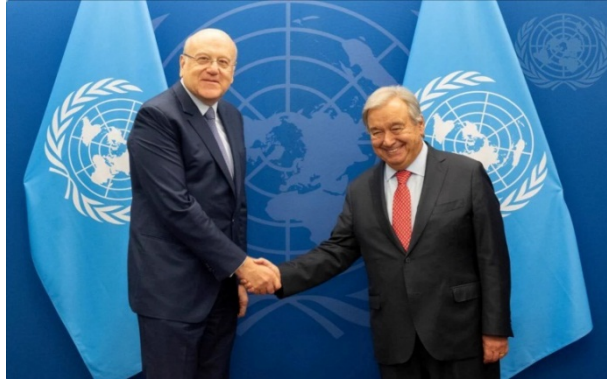
Najib Mikati's meeting with the UN Secretary General

► Najib Mikati, prime minister of the Lebanese interim government , met in New York with Antonio Guterres, Secretary General of the United Nations . Mikati thanked Guterres for the UN's support of Lebanon. He called for increased financial support and help to stop "Israeli violations of Lebanese sovereignty" (Twitter account of the office of the Lebanese interim prime minister, September 19, 2023).