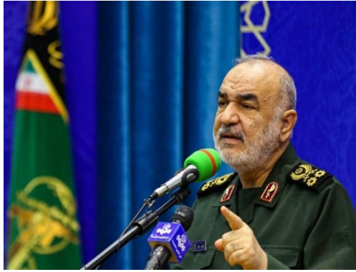
IRGC commander