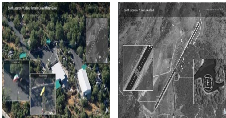
Right: Aerial photograph of the airport. Left: A compound near the airport where Hezbollah and Iranian flags are visible (Israeli Ministry of Defense, September 11, 2023)

► Israeli Defense Minister Yoav Gallant, speaking at a conference at Reichman University, revealed photos documenting an airport being built by Iran in southern Lebanon (Kan News 11, September 11, 2023). The airport is in the Qalaat Jabbour mountain region, known as Hezbollah’s training area, 20 km (about 12 miles) from the border with Israel (north of Metula). The compound was built after the Second Lebanon War (2006) under the supervision of Imad Mughnieh, who served as head of Hezbollah’s military-terrorist wing until his assassination on February 12, 2008. Residential buildings, shooting ranges, and training areas were identified on the airport grounds, including a training complex for urban warfare (Al-Janoubia, September 12, 2023).