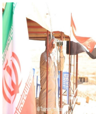
Qods Force commander visits Syria (Tasnim, September 21, 2023).

► The Syrian news channel Ayn al-Furat reported (September 13, 2023) that the IRGC had recently taken new security measures at the Soleimani military base in and around the town