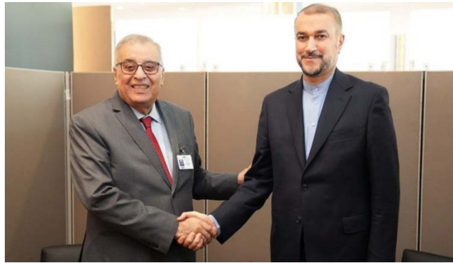
The meeting of the foreign ministers of Iran and Lebanon (IRNA, September 22, 2023)