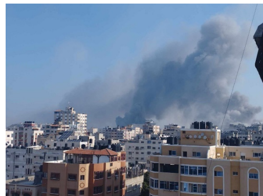
Air Force strikes in Gaza (QudsN Twitter account, October 12, 2023)