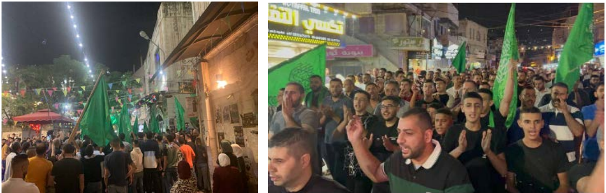
Right: A procession in Tulkarm. Left: A procession in Nablus (Shehab Twitter account, October 11, 2023)