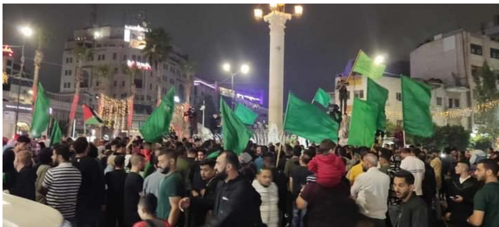
A march in Ramallah (Shehab Twitter account, October 11, 2023)