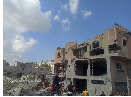
IDF attack in the Tel Sultan neighborhood in western Rafah (Shehab Twitter account, October 12, 2023)