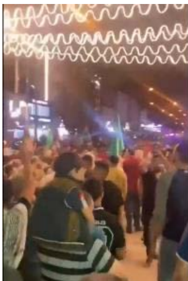
Amman Support Rally