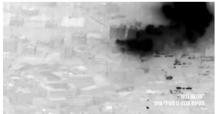
Right: Attack on a building where terrorist operatives were staying. Left: Attack on an apartment used as a Hamas control center (IDF spokesman's Twitter account, October 12, 2023)