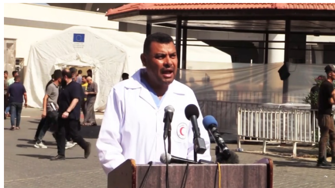
Dr. Ashraf al-Qidra holds a press conference (Facebook page of the ministry of health in Gaza, October 12, 2023)

► Dr. Ashraf al-Qidra, spokesman for the ministry of health in Gaza , held a press conference where he said that since the beginning of the war, the number of dead had passed 1,220 and the number of wounded was more than 5,800. He said that the public health system in the Gaza Strip had begun to collapse and all hospitals were fully occupied ministry of health in Gaza (Facebook page of the ministry of health in Gaza, October 12, 2023).