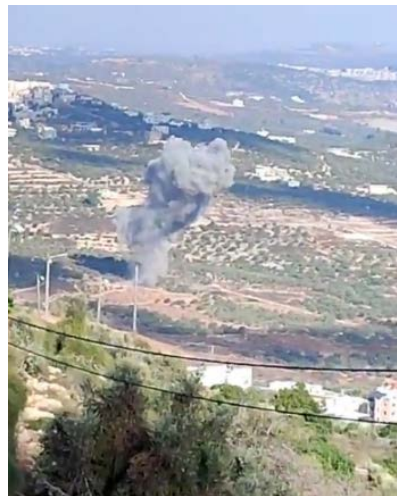
Right: A rocket from Gaza falls near Ariel. Left: A fire in Ashkelon caused by a rocket hit