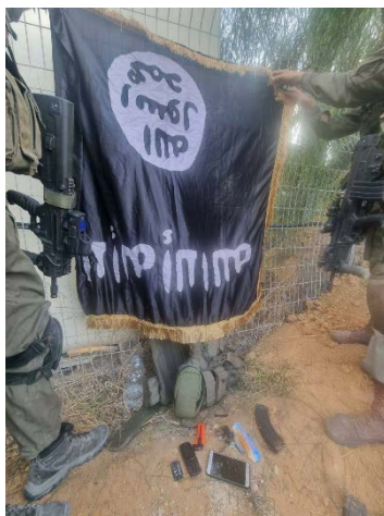
An ISIS flag found in Kibbutz Sufa among the equipment of Hamas terrorists

He claimed Islam forbade them to attack civilians, and the Izz al-Din Qassam Brigades "fighters" carried out the instructions of Muhammad Deif on the subject, and there were even videos that prove it. He claimed the "resistance" attacked soldiers and the instructions of the fighters on the ground were to attack soldiers and military bases ( Hamas website, October 11, 2023).