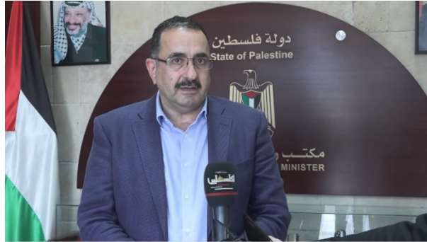
Zafer Melhem (Muhammad Shtayyeh's Facebook page, October 11, 2023)

function and would become mass cemeteries (Muhammad Shtayyeh's Facebook page, October 11, 2023).