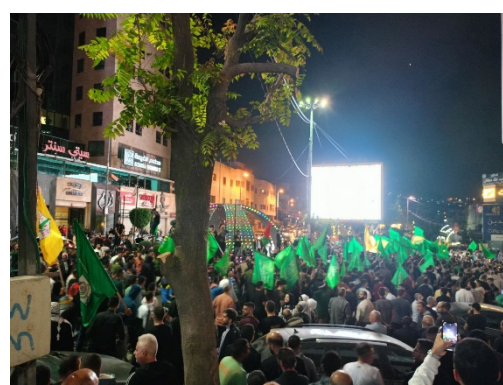
A procession in Hebron (Shehab Twitter account, October 11, 2023)