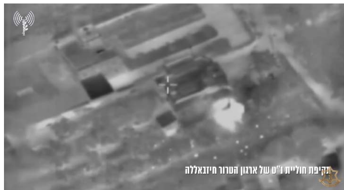
The IDF targets in Lebanon (IDF spokesman's website, November 11, 2023)