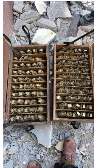
Weapons found near a kindergarten in Beit Hanoun (northern Gaza Strip)

► So far, the security forces in the Gaza Strip have killed about twenty terrorist operatives from various organizations, mainly Hamas, most of them released in the Gilad Shalit exchange deal, who were responsible for directing terrorist attacks. Half of them belonged to the West Bank Headquarters, in charge of recruiting terrorists from Judea, Samaria and Jerusalem and financing and managing their terrorist activity. In addition, more than ten targets were attacked where Hamas operatives were staying, who were released in the Gilad Shalit exchange deal had continued to engage in terrorist activity, especially financing and planning terrorist attacks in Judea, Samaria and Israel.