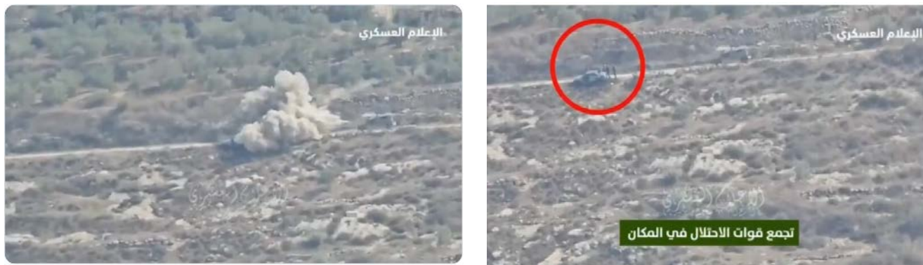
Photos from the video: Soldiers inspect the vehicle and IEDs explode (al-Mayadeen TV X account, November 11, 2023)

against them that had been placed in advance near the vehicle (Palinfo, November 11, 2023; al-Mayadeen TV website, November 11, 2023). 2