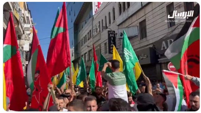
Right: A march in Ramallah. Fatah and PFLP flags can also be seen (QudsN X Account, November 10, 2023). Left: A march in Nablus (@Sa7atPIBreaking X account, November 10, 2023)