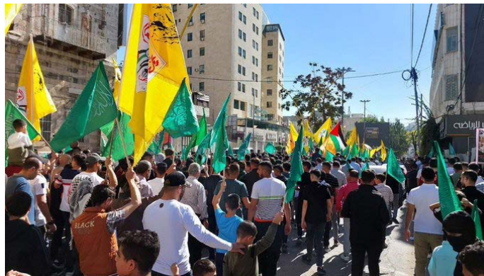
A procession in Hebron (al-Ghadir TV X account, November 10, 2023)

►The Bani Abu Jandal 3 network, which claims to have dozens of PA security apparatus operatives as its members, published a second list (the first was published on November 6, 2023) of 13 operatives and officers in the PA's security forces in Ramallah, al-Bireh and Nablus, who announced they were stopping to obey orders because of the PA's policy regarding the war in the Gaza Strip (arabi21 website, November 11, 2023).