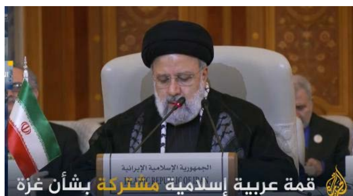
Iranian President Ebrahim Raisi speaking at the conference (al-Jazeera, November 11, 2023)

►The concluding statement of the conference noted the participants' concern "over the humanitarian catastrophe in the Gaza Strip" and stressed the need to stop military operations and protect civilians in accordance with international law. They also stressed the importance of the international community's role in exerting pressure on Israel to stop the attacks and the "forced expulsion" of Palestinians from the Gaza Strip, which was a blatant violation of humanitarian and international law. Moreover, they also stressed the need to enable international humanitarian organizations, and UNRWA in particular, to fulfill their role in providing assistance to the Palestinian people.