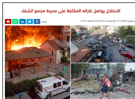
The photos published by Ma'an Agency (Ma'an, November 11, 2023)