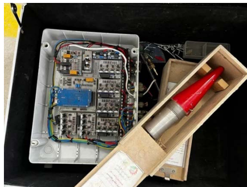
Right: An operating and calibration system for anti-aircraft rockets found in a Hamas military outpost. Left: Additional weapons (IDF spokesman’s website, November 10, 2023)

◆ Fierce battles were waged in the south Sheikh Ajlin neighborhood in the west of Gaza City, in which IDF forces killed terrorists from the Izz al-Din Qassam Brigades’ Sabra Battalion. The forces located and destroyed terrorist tunnel shafts and tunnels, rocket launchers, weapons warehouses and observation posts (November 11, 2023).