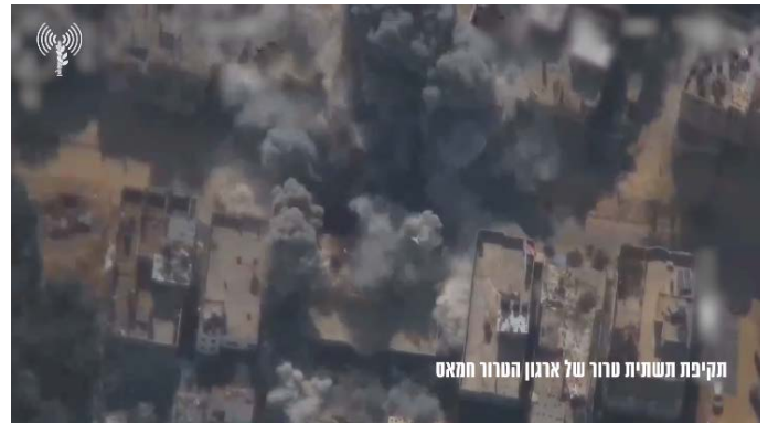
Attacking targets in the Gaza Strip