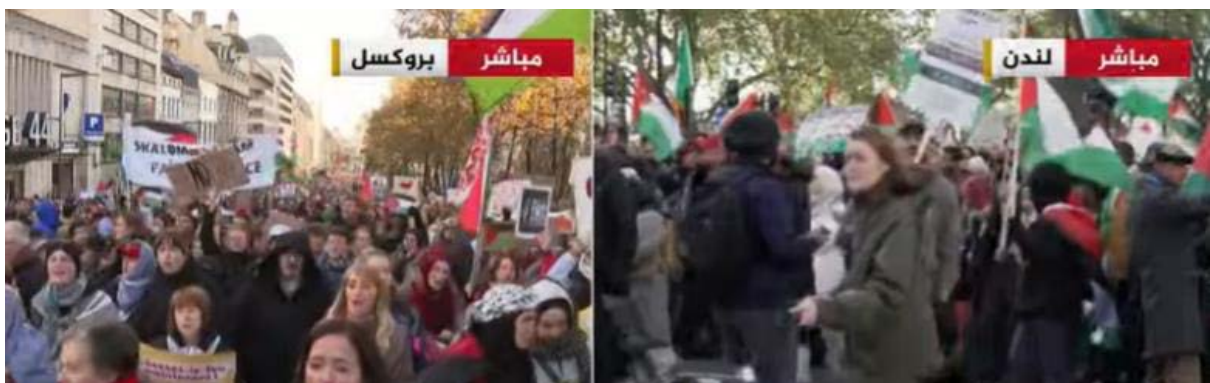
Demonstrations in support of the Palestinians in London and Brussels (al-Jazeera, November 11, 2023)

► On November 11, 2023, pro-Palestinian demonstrations of support were held around the world, including events in Johannesburg, London and Brussels (al-Jazeera, November 11, 2023).