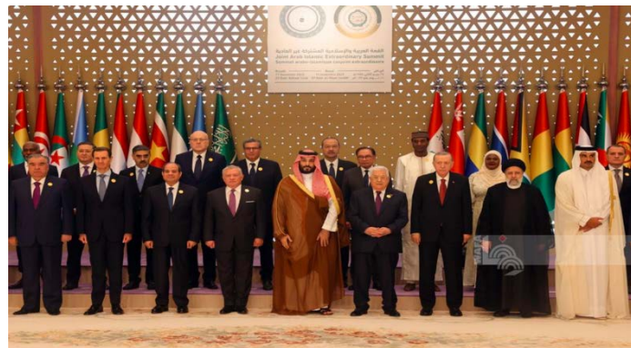
Right: The Arab Islamic Summit in Riyadh (Wafa, November 11, 2023). Left: Mahmoud Abbas giving a speech (Mahmoud Abbas' Facebook page, November 11, 2023).