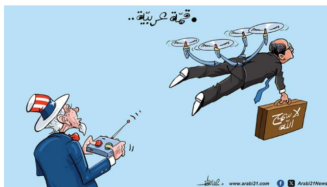
Palestinian cartoon criticizing the summit, which is remotely controlled by the United States. The Arabic text reads, “Arab summit”