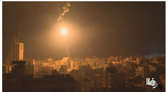
Night strikes. Flares light the sky (Wafa YouTube channel, November 12, 2023)

► Naval activity: On the night of November 10, 2023, Israeli Navy forces attacked buildings used by Hamas in the northern Gaza Strip, including warehouses where the Hamas naval force stored equipment. Under the direction of infantry forces, naval forces attacked buildings in the Shati refugee camp (IDF spokesman, November 11, 2023). Since the beginning of the fighting, Israeli Navy vessels have attacked hundreds of terrorist targets, including observation posts, anti-tank squads, vessels, posts and military facilities. As of November 10, forces at sea and on land had killed approximately 200 terrorists, among them Hamas naval