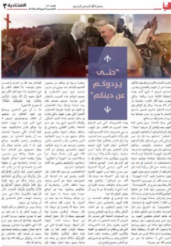
The article in al-Nabā' (November 9, 2023)

► ISIS's weekly al-Naba published an editorial titled "Until they make you abandon your religion." 6 According to the article, the recent events in "Palestine" prove once again that Jews and Christians are hostile to Muslims and that the struggle between Muslims and non-Muslims is a religious rather than a national, ideological or economic one (al-Nabā' weekly, Telegram, November 9, 2023).