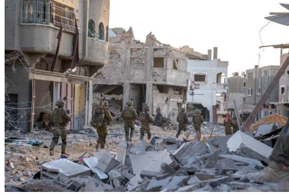
Activities of IDF forces in the Gaza Strip