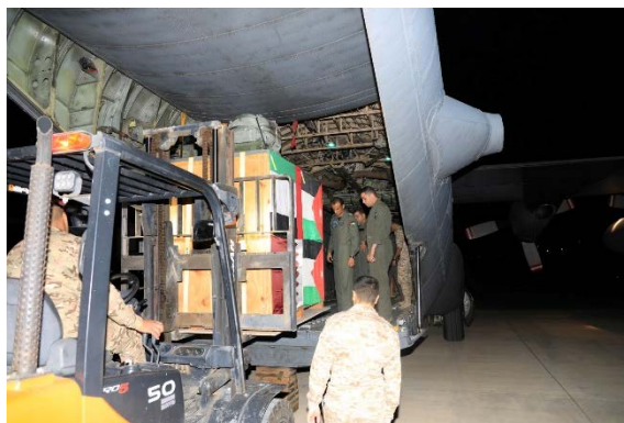
Loading the medical aid onto a Jordanian military aircraft