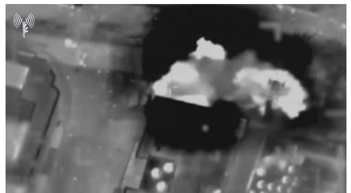
Attacking targets in the Gaza Strip