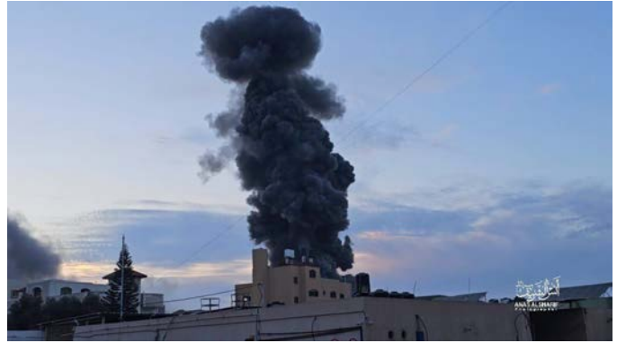
Right: An attack near the Indonesian Hospital in the northern Gaza Strip. Left: Israel Air Force attack in the al-Saftawi area in the northern Gaza Strip