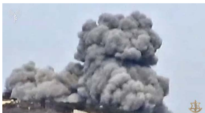
The IDF attacks Hezbollah targets in Lebanese territory