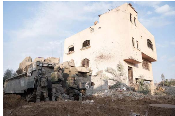
Documenting the forces' activities (IDF spokesman website, November 10, 2023)

► Aerial activity: In recent days Israeli Air Force aircraft, with the assistance of the ground forces, attacked approximately 5,000 terrorist targets in the Gaza Strip. About 3,300 strikes were carried out by fighter jets, about 860 by helicopter gunships and over 570 out by UAVs (IDF spokesman, November 11, 2023).