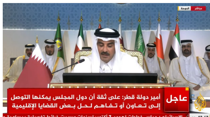
Sheikh Tamim speaking at the conference (al-Jazeera, December 5, 2023)

He stressed Israel was committing "war crimes and crimes against humanity" and that the top priority now was to declare a permanent and immediate ceasefire and ensure the continuous entry of humanitarian aid into the Gaza Strip (Anadolu News, December 5, 2023).