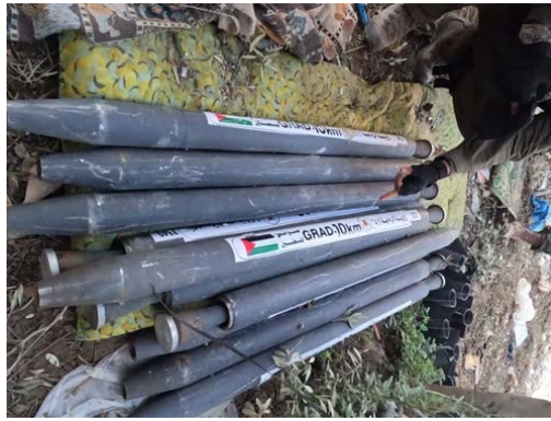
Rockets found in the yard of a house in the northern Gaza Strip (IDF spokesperson, December 5, 2023)