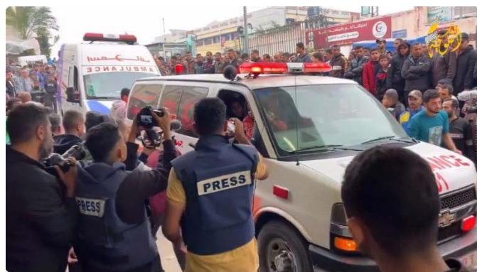
Evacuation of casualties in the Khan Yunis area to Nasser Hospital in the city (QudsN X account, December 5, 2023)