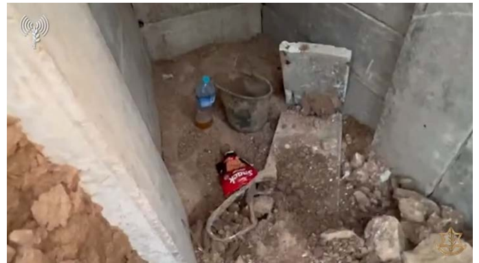
Right: A terrorist fighting position. Left: A tunnel used by Hamas terrorist operatives (IDF spokesperson, December 4, 2023)