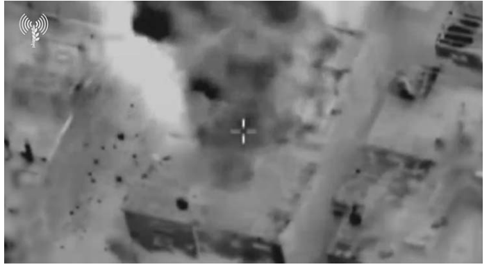
IDF attacks in the Gaza Strip