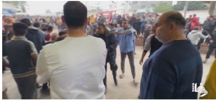
Gazans gather at the main entrance of Nasser Hospital in Khan Yunis and Hamas police try to restore order