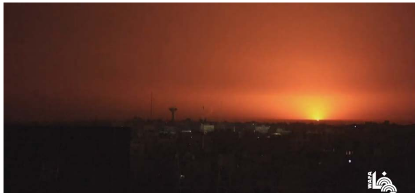
Israeli Air Force night strikes in the Rafah region (Wafa YouTube channel, December 5, 2023)

► Naval activity: Israeli Navy fighters attacked dozens of terrorist targets to assist the forces operating on land, including buildings from which the terrorists fought and launched mortar shells (IDF spokesperson, December 5, 2023).