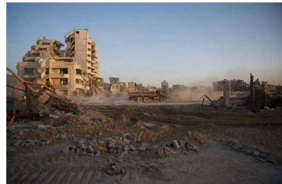
IDF forces in the Gaza Strip (IDF spokesperson, December 5, 2023)

► Aerial activity: Israeli Air Force aircraft continued attacking terrorist targets, including rocket launchers, terrorist facilities, ammunition depots and terrorist squads (IDF spokesperson, December 5, 2023).