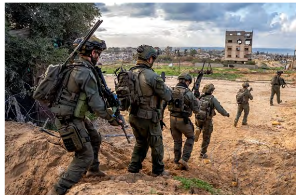
IDF forces in the Gaza Strip