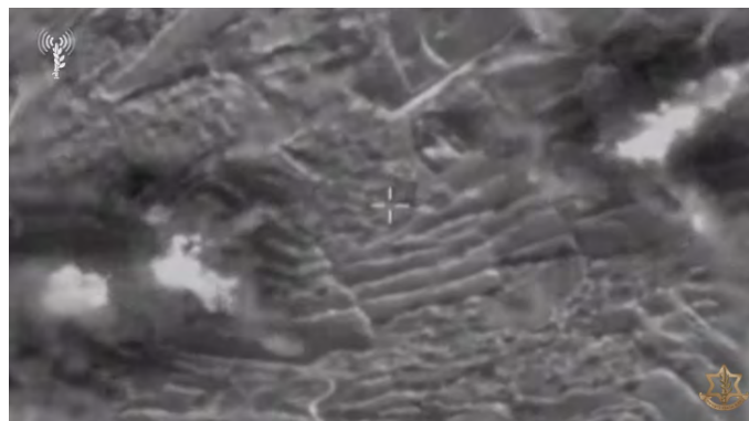
Right: Attack on Hezbollah facilities. Left: Attack on the building where the terrorist who fired the missile at the church was hiding