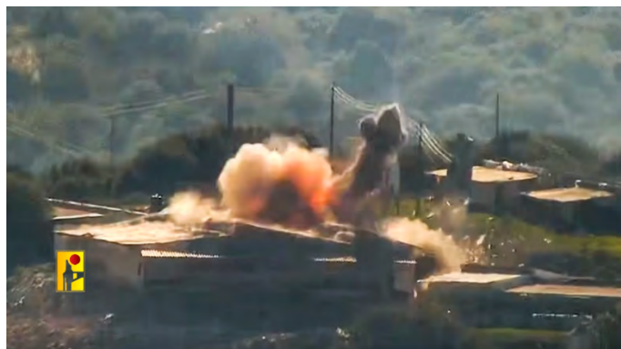
Guided missile hits a building in Dovev (Hezbollah's combat information Telegram channel, December 26, 2023)

►The IDF responded with artillery fire and attacks on Hezbollah infrastructure in Lebanese territory. The IDF attacked a building where the terrorist who fired the anti-tank missile at the church was hiding. It was found that the missile fired at Dovev was launched from an area near a mosque in the village of Yaroun in south Lebanon (IDF spokesperson, December 26, 2023).