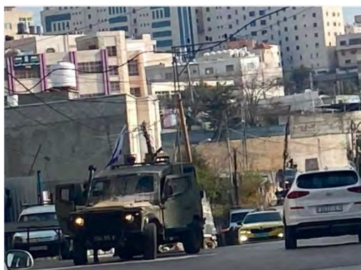
Israeli security forces operating in Hebron

► During the past day, Israeli security forces also operated in the al-Dheisheh refugee camp in Bethlehem. They seized the equipment of a printing press that had printed inflammatory materials for Hamas, and a drone. In Hebron, Israeli security forces detained several wanted Palestinians (IDF spokesperson's Telegram channel, December 27, 2023).