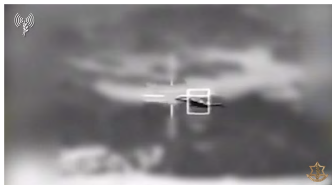
Interception and destruction of the target (IDF spokesperson, December 26, 2023)