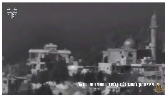
Missile launch near a mosque (, December 26, 2023)