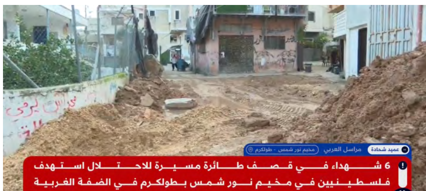
Al-Arabi TV correspondent reports on damage to infrastructure in the Nur al-Shams refugee camp

► During the past day, Israeli security forces also operated in the al-Dheisheh refugee camp in Bethlehem. They seized the equipment of a printing press that had printed inflammatory materials for Hamas, and a drone. In Hebron, Israeli security forces detained several wanted Palestinians (IDF spokesperson's Telegram channel, December 27, 2023).