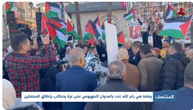
Right: Activity held in Ramallah. Left: Activity in Jenin

► Hamas in Judea and Samaria called on the Palestinians to participate en masse in demonstrations to be held on December 29, 2023, after Friday prayers, from the main mosques in Judea, Samaria and Jerusalem, calling for an end to the siege on al-Aqsa Mosque and in support of the Gaza Strip and the “resistance” [terrorist organizations] (Hurriya News, December 27, 2023).