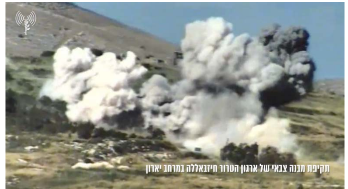
Right: Attack in Yaroun. Left: Attack in Maroun al-Ras (IDF spokesperson, May 7, 2024)