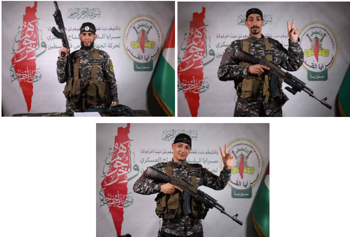
The casualties of the PIJ's Jerusalem Brigades in Syria (Jerusalem Brigades combat information Telegram channel, May 8, 2024)