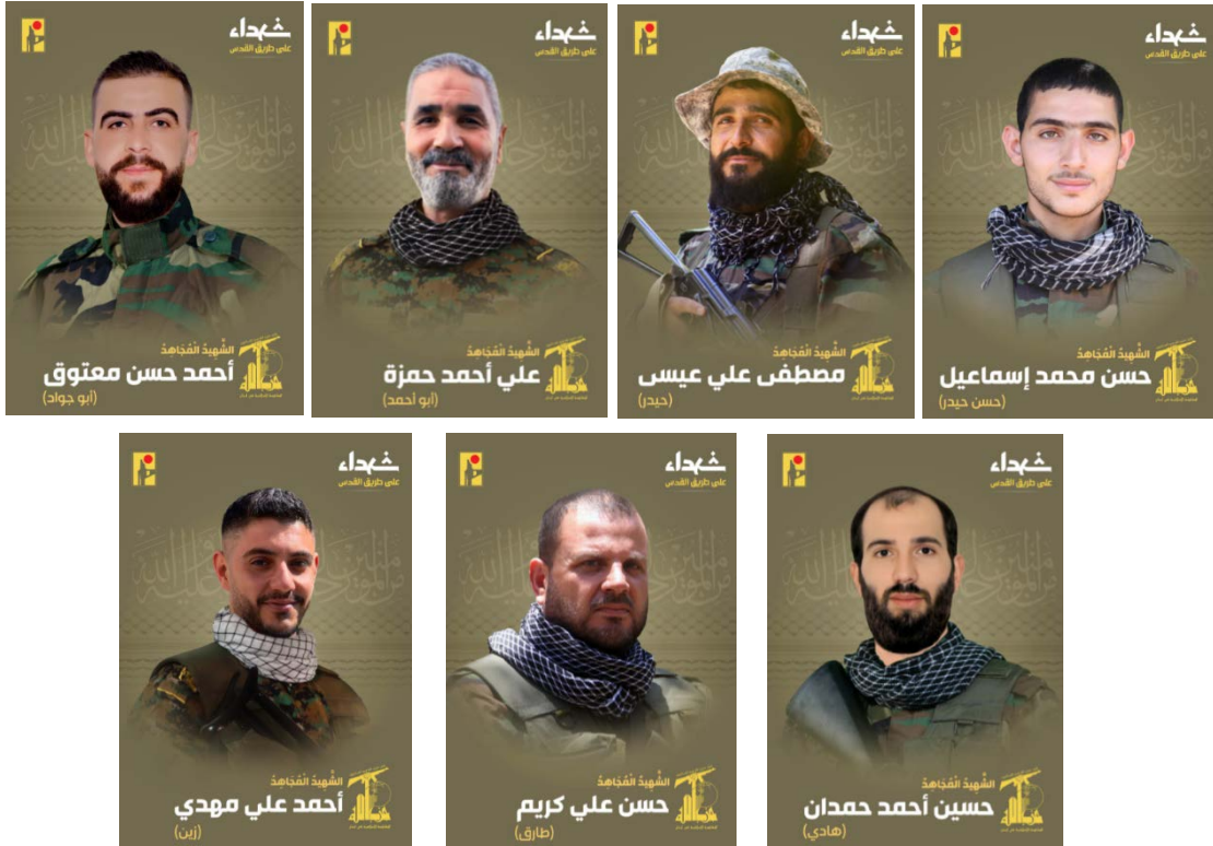
Hezbollah casualties (Hezbollah combat information Telegram channel, May 6-11, 2024)