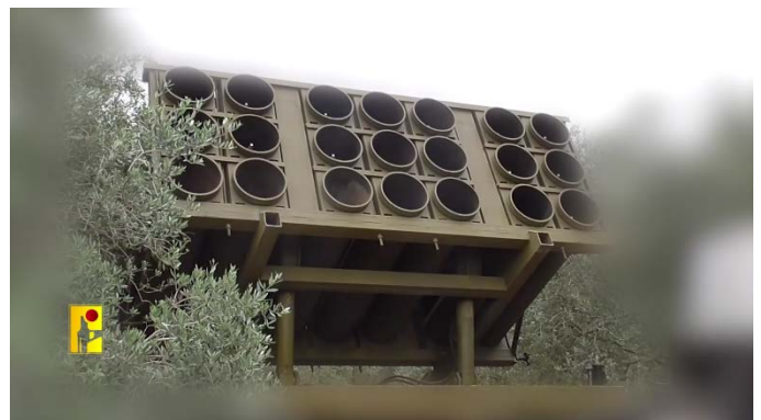
Right: Hezbollah rocket launcher firing at Kiryat Shmona. Left: Fires caused by rocket fire near Kiryat Shmona