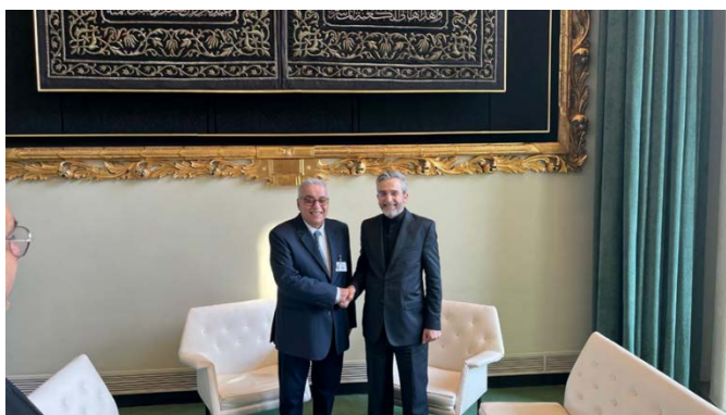
The meeting between the Iranian acting foreign minister and the Lebanese foreign minister in New York (Iranian Foreign Ministry website, July 18, 2024)

► During his visit to New York, Bagheri met with Lebanese Foreign Minister Abdallah Bou Habib to discuss regional developments and relations between the two countries. Bagheri stressed Iran’s support for stability and security in Lebanon as well as for the “resistance in Palestine.” He said Iran was striving to stop the Israeli attacks on the Gaza Strip to prevent the expansion of the war in the region. He stressed that Muslim countries had to make Israel regret its threats against Lebanon (Iranian Foreign Ministry website, July 18, 2024).