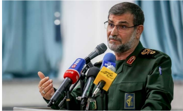
The commander of the IRGC Navy (snn.ir, July 23, 2024)

“resistance” despite the Israeli attacks and heavy losses in the Gaza Strip (Iranian SNN news agency, July 23, 2024).