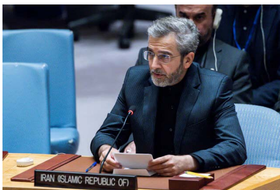
Acting Iranian Foreign Minister Bagheri (ISNA, July 17, 2024)

► During his visit to New York, Bagheri met with Lebanese Foreign Minister Abdallah Bou Habib to discuss regional developments and relations between the two countries. Bagheri stressed Iran’s support for stability and security in Lebanon as well as for the “resistance in Palestine.” He said Iran was striving to stop the Israeli attacks on the Gaza Strip to prevent the expansion of the war in the region. He stressed that Muslim countries had to make Israel regret its threats against Lebanon (Iranian Foreign Ministry website, July 18, 2024).