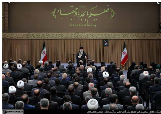
The Supreme Leader meets with Majles members (Supreme Leader’s website, July 21, 2024)

►Meeting with Iranian President-elect Masoud Pezeshkian and members of the Iranian Majles, Supreme Leader Ali Khamenei declared that the issue of Gaza remained the Muslim world’s top priority even nine months after the outbreak of the war, saying it is even more important today than in the first days of the war. Khamenei praised the “resistance,” which, he claimed, was demonstrating its strength more and more by the day, noting that the Majles could not remain silent about the Gaza issue. He added that the “resistance” was facing a large political, economic, and military system called the United States, which was fighting it alongside the “Zionist regime.” He claimed that since the United States and Israel had not succeeded in bringing Hamas and the “resistance” to their knees, they were dropping bombs at hospitals, schools, and at the heads of children, women, and civilians (Supreme Leader’s website, July 21, 2024).