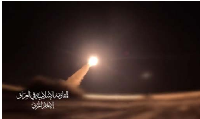
Cruise missile being launched at Haifa (Islamic Resistance in Iraq Telegram channel, July 19, 2024)