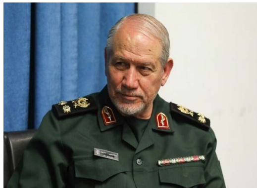
Yahya Rahim Safavi

►Yahya Rahim Safavi, the senior military advisor to the Supreme Leader of Iran, said that despite the large number of fatalities in the Gaza Strip, the Palestinians had not retreated and were continuing their steadfastness. He noted that if 20 million pilgrims changed their route during the Arbaeen ceremonies 2 and instead of turning toward Karbala, turned toward Jerusalem to liberate “Palestine,” Israel would not be able to resist them. He noted that Israel could do nothing against the Iranian attack against it on April 13, 2024, and that no country or leader had dared to make a decision like Supreme Leader Ali Khamenei did when he decided to attack Israel. He added that it was impossible to know when Jerusalem would be liberated but referred to Iranian Supreme Leader Khamenei’s statement that “the Zionist regime will not live to see the next 25 years and, with God’s help, we will pray together in Jerusalem”.