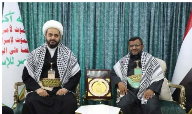
Al-Khazali (left) next to Abu Idris al-Sharafi (al-Khazali's X account, July 21, 2024)

solidarity with the Houthi movement after the Israeli airstrike in the city of al-Hudaydah, Yemen, in response to the Houthis' attacks against Israel (al-Khazali's X account, July 21, 2024).