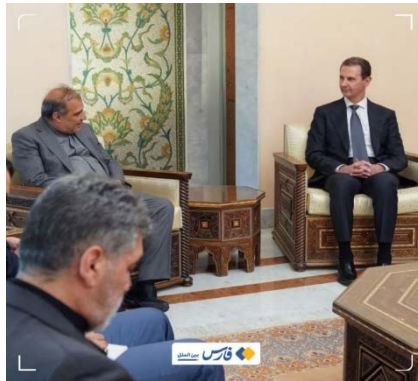
The advisor to the Iranian foreign minister meets with the Syrian president