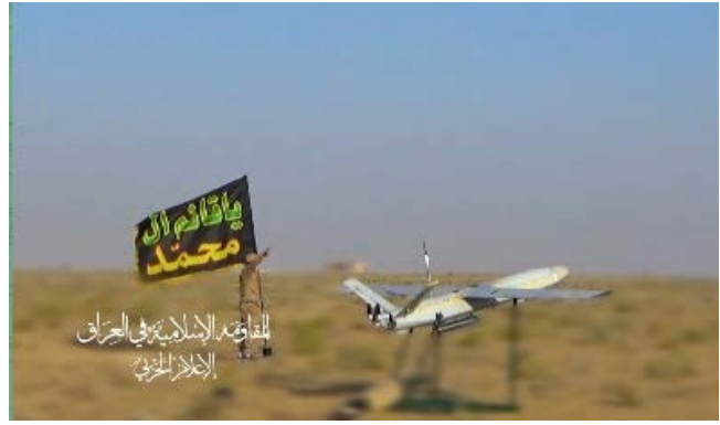
The UAV launched at the Olvia (Telegram channel of the Islamic Resistance in Iraq, July 15, 2024)