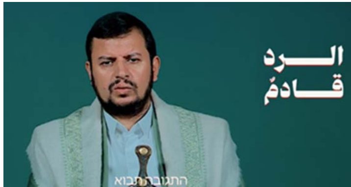
Abd al-Malik al-Houthi in a threatening message from the video (the Houthis’ combat media arm Telegram channel, August 18, 2024)

► On August 18, 2024, the Houthis released a 1:01-minute video titled “The response will come.” The video included an excerpt translated into Hebrew from Houthi leader Abd al-Malik al-Houthi’s last speech on August 15, 2024, in which he threatened that the response of the “axis of resistance” to the Israeli actions would surely come. The video includes excerpts from Hezbollah’s video about the underground Imad-4 facility for storing long-range missiles and rockets, as well as launches of surface-to-surface missiles from Iran (the Houthis’ combat media arm Telegram channel, August 18, 2024).