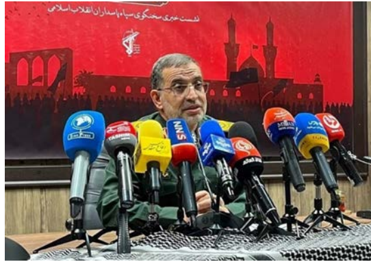
The IRGC spokesman (Tasnim, August 20, 2024)

decision that will alter the enemy's set of considerations. He added that Iran's retaliation might not mirror past actions and stressed that no attack on Iranian targets had gone unanswered, warning that the enemy should expect calculated and precise strikes. The IRGC spokesman also said Iran did not believe that the United States was interested in peace or a ceasefire, accusing it of playing a political game (Tasnim, August 20, 2024).