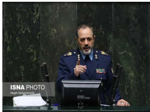
Incoming Defense Minister Aziz Nasirzadeh (ISNA, August 19, 2024)

► Iran's incoming defense minister, Aziz Nasirzadeh, said during a Majles discussion prior to the confirmation of his appointment as defense minister that after the al-Aqsa Flood, the "Zionist regime" with the help of the United States crossed all red lines by committing "war crimes" against the Palestinian people in the Gaza Strip and engaging in "cowardly assassinations." He added that Iran had successfully strengthened its international position, particularly in West Asia, and reinforced the foundations of the "resistance" under the influence of strategic conditions. According to Nasirzadeh, the "resistance front" is not separate from Iran and is part of its armed forces. He added that Iran's strategic depth had changed greatly compared to the past two decades and that the power it had developed enabled it to play a central role in the region and beyond (ISNA, August 19, 2024).