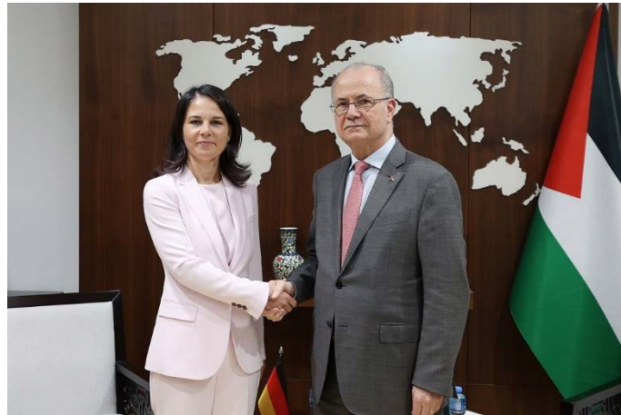
Mustafa and Baerbock (Vafa, September 6, 2024)

reconstruction of the Gaza Strip after the end of the "aggression." Baerbock addressed the importance of reaching a ceasefire agreement and halting the latest escalation in Judea and Samaria, which she claimed included the destruction of EU- and German-funded facilities (Wafa, September 6, 2024).