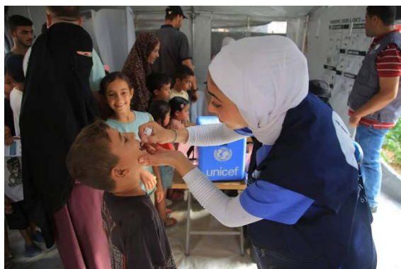
Vaccinating children against polio in the northern Gaza Strip (ministry of health in Gaza Telegram channel, September 10, 2024)

secretary general, praised the humanitarian ceasefire that made the vaccinations possible, calling it a "rare ray of hope" (UN website, September 3, 2024).