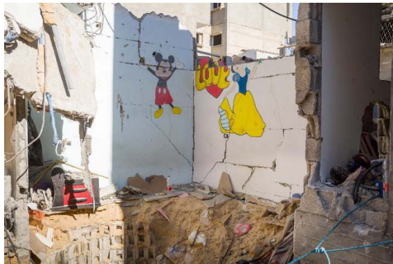
The opening of the tunnel shaft in the children's room (IDF spokesperson, September 4, 2024)

► This past week Israeli Air Force aircraft continued to attack terrorist operatives and facilities operating from civilian sites in the Gaza Strip and attacking IDF forces and the State of Israel. In all cases preliminary steps were taken to reduce possible harm to civilians. The terrorist organizations in the Gaza Strip, especially Hamas, have typically used civilian sites such as schools, hospitals and shelters for terrorist purposes. The terrorist organizations exploit IDF reprisals for propaganda and incitement purposes while exaggerating the number of victims and their alleged injuries, and in most instances concealing the identity of the terrorists who were attacked: 2