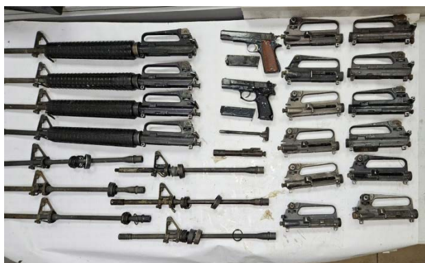
Weapons seized at the Jordanian border (Israel Police Force spokesperson, September 5, 2024)