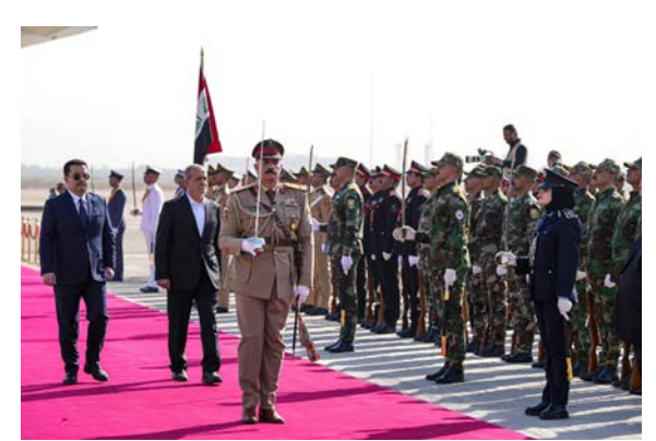
Pezeshkian received by the Iraqi prime minister upon arrival (al-Alam TV, September 11, 2024)

officials and sign cooperation agreements between the two countries (ISNA, September 11, 2024).