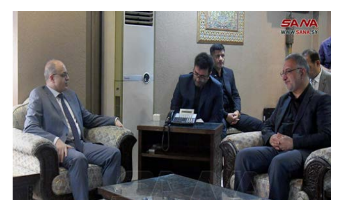
The mayor of Tehran meets with the Syrian minister of economy (SANA, September 4, 2024)

►On September 5, 2024, Tehran and Damascus signed a Twin Cities Agreement. The agreement, signed in the presence of the mayor of Tehran and the governor of the Damascus Governorate, focuses on cooperation in various fields, including transportation, municipal waste recycling, automation, and electronic systems (al-Watan, September 5, 2024). During his visit to Damascus, Tehran Mayor Ali-Reza Zakani met with Syrian Economy and Foreign Trade Minister Mohammad Samer al-Khalil to discuss enhancing economic and trade cooperation between the two sides (SANA, September 4, 2024).