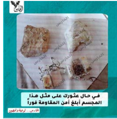
Right: The alleged espionage devices camouflaged as stones (al-Akhras Telegram channel, September 19, 2024). 2 Left: Announcement from the ministry of interior and defense in the Gaza Strip warning the residents (Quds Agency, September 23, 2024)

► In the wake of the explosion of thousands of Hezbollah operatives' hand-held communications devices in Lebanon, 3 a "senior commander" in the Palestinian Islamic Jihad's Jenin Battalion said they were planning to take "extreme" precautionary measures. He claimed the operatives were already avoiding the use of mobile phones and had recently given up the use of walkie-talkies for fear that Israel would hack them (The Washington Post, September 22, 2024).