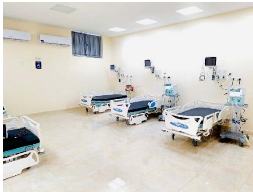
The new field hospital (COGAT X account, September 22, 2024)

►The Israeli Coordinator of Government Activities in the Territories (COGAT) said that the 13 th field hospital had been established in the Gaza Strip. The hospital is located in Deir al-Balah and will be managed by Doctors Without Borders. According to reports, the hospital will be expanded from a capacity of 20 beds to 110, and will include an emergency room, a maternity ward and a surgical ward (COGAT X account, September 22, 2024).