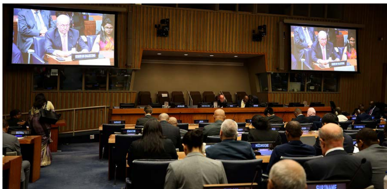
Mustafa speaks at a meeting of the foreign ministers of the non-aligned countries

► On September 20, 2024, Mahmoud al-Habash, Mahmoud Abbas' advisor for religious affairs and Islamic relations, and supreme cadí (judge) of the Sharia courts of the PA, met in Moscow with Mikhail Bogdanov, the Russian deputy foreign minister and Russian special envoy to the Middle East. They discussed efforts to stop [alleged] Israeli "aggression" in the Gaza Strip, Judea, Samaria and east Jerusalem, and the need to strengthen bilateral Russian-Palestinian ties and cooperation (Mahmoud al-Habash' Facebook page, September 20, 2024). In a speech to the 20 th Conference of the World Islamic Forum held in Russia, al-Habash said that the Palestinian people wanted peace, strived for it and sacrificed for it, proof of which was when the PLO agreed to the establishment of a state on part of the "historic homeland" (Mahmoud al-Habash' Facebook page, September 21, 2024).