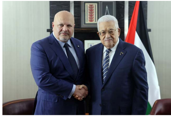
Mahmoud Abbas with Karim Khan (Wafa, September 23, 2024)