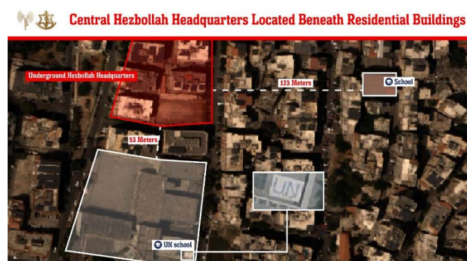
The location of Hezbollah's central headquarters, near schools (IDF spokesperson, September 29, 2024)

►The attack on the Hezbollah headquarters followed an increase in Israeli Air Force attacks on Hezbollah targets in Lebanon: on September 20, 2024, Ibrahim Aqil, the head of Hezbollah's operations and commander of the Radwan Force, and high-ranking Radwan Force officers, were eliminated in an attack on the Dahiye al-Janoubia. On September 23, 2024, the IDF launched Operation Northern Arrows, which included attacks on Hezbollah's military infrastructure in various areas throughout Lebanon and targeted attacks on senior Hezbollah terrorist operatives. 3