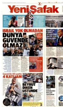
The front page Yeni Şafak, September 29, 2024