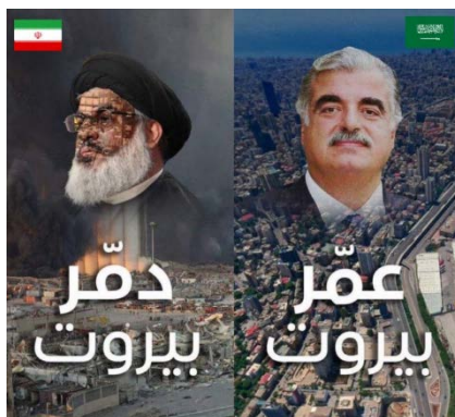
Al-Hariri vs. Nasrallah