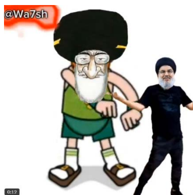
Nasrallah dances with Khamenei