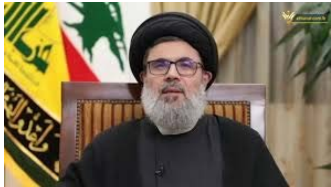
Hashem Safi al-Din (al-Manar, November 30, 2023)

► According to reports on September 29, 2024, Shura Council chose Hashem Safi al-Din as Hezbollah's new secretary general (al-Hadath, September 29, 2024). Hezbollah added that official announcements from the organization regarding the organization's leadership should be awaited (Hezbollah combat information Telegram channel September 30, 2024).