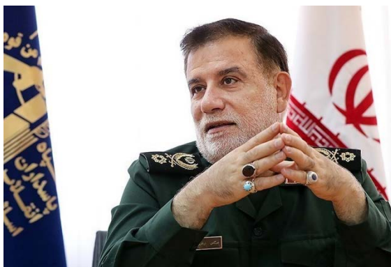
Abbas Nilforoushan (snn.ir, September 29, 2024)

►The Iranian Revolutionary Guards Corps (IRGC) announced that Abbas Nilforoushan, deputy commander of the Qods Force in Lebanon, was killed in the attack in Beirut in which Nasrallah was killed. The IRGC condemned the "crimes of the Zionist regime against Lebanon" and expressed their condolences on Nilforoushan's death. The announcement did not include an explicit threat to retaliate for his death (snn.ir, September 29, 2024).