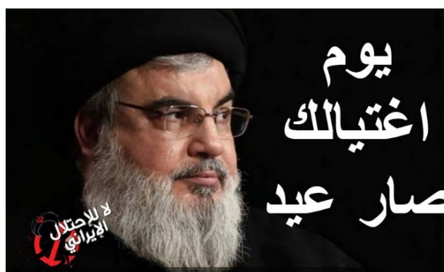
Announcement of the "holiday" commemorating the death of Nasrallah (X account of "No to the Iranian Occupation," September 28, 2024)