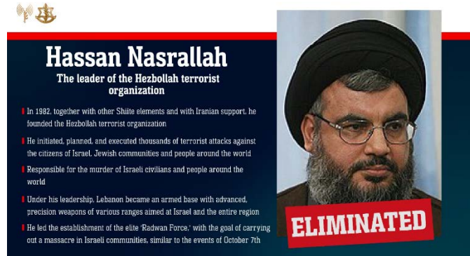
Nasrallah's "IDF card" (IDF spokesperson, September 28, 2024)

the world. He added that Nasrallah either made or approved of all strategic and internal decisions, and sometimes tactical decisions as well, and that Hezbollah's joining the fighting against Israel on October 8, 2023, dragged Lebanon and the entire region into an escalation of the hostilities (IDF spokesperson, September 28, 2024).