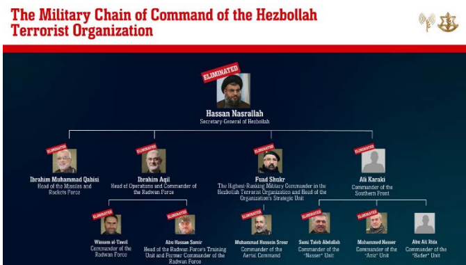
Hezbollah's chain of military command after the elimination of Nasrallah (IDF spokesperson, September 28, 2024)