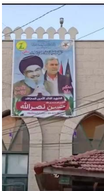
Nasrallah and Ziyad al-Nakhalah, PIJ secretary general, in the Jenin refugee camp

► Mahmoud Abbas, Palestinian Authority chairman, sent his condolences to Hezbollah on the death of Nasrallah. He also offered his condolences to the Lebanese government and the Lebanese people for "the deaths of civilian victims who were killed as a result of brutal Israeli aggression." He called it "a continuation of the war of extermination [sic] against the Palestinian people and the Lebanese people" (Wafa, September 28, 2024). The PLO Executive Committee sent its "deepest condolences" to Hezbollah for the "martyrdom" of Nasrallah. It also called for an urgent end to the "war of genocide against the Palestinian and Lebanese people" (Wafa, September 28, 2024).