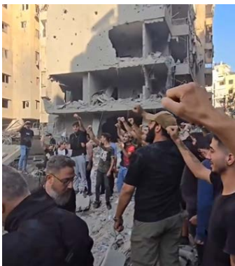
Lebanese Shi'ites mourn Nasrallah at the scene of the attack in Beirut

►The announcement of Nasrallah's death sparked outpourings of grief among the Shi'ites in Lebanon, especially in their strongholds in south Lebanon and in the Dahiyeh al-Janoubia in Beirut. Shiite residents called him a "father figure" and said they would continue "to fight to overthrow Israel because, that was always his wish" (al-Jazeera, September 28, 2024).