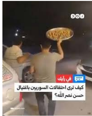
Distributing sweets in northern Syria