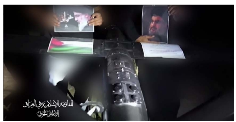
Right: Photos of Hassan Nasrallah on a drone (Islamic Resistance in Iraq Telegram channel, October 2, 2024). Left: Three drones being launched at various targets (Islamic Resistance in Iraq Telegram channel, October 5, 2024)