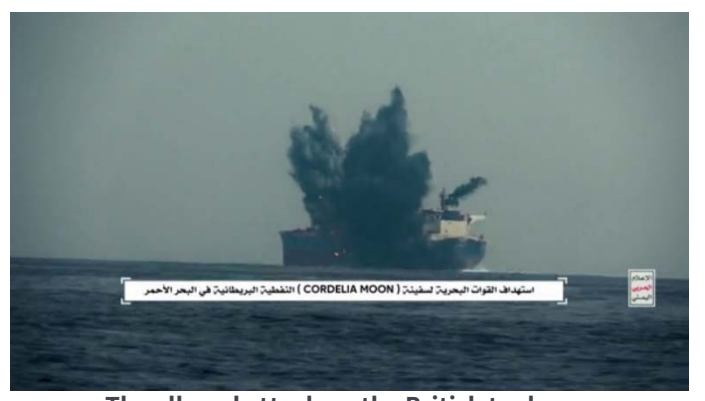
The alleged attack on the British tanker

▶ On October 1, 2024, Houthi forces spokesman Yahya Saria claimed responsibility for three attacks against vessels (Yahya Saria's X account, October 1, 2024): a combined attack against a British oil tanker in the Red Sea using ballistic and cruise missiles, a drone, and an unmanned surface vehicle (USV); The United Kingdom Maritime Trade Operations (UKMTO) confirmed that the tanker was hit by a USV and was damaged. However, there were no casualties and it continued on its way (UKMTO X account, 1 October 2024); A complex attack against a cargo ship using a cruise missile in the Indian Ocean and a UAV in the Arabian Sea. There has been no verification of the claims.