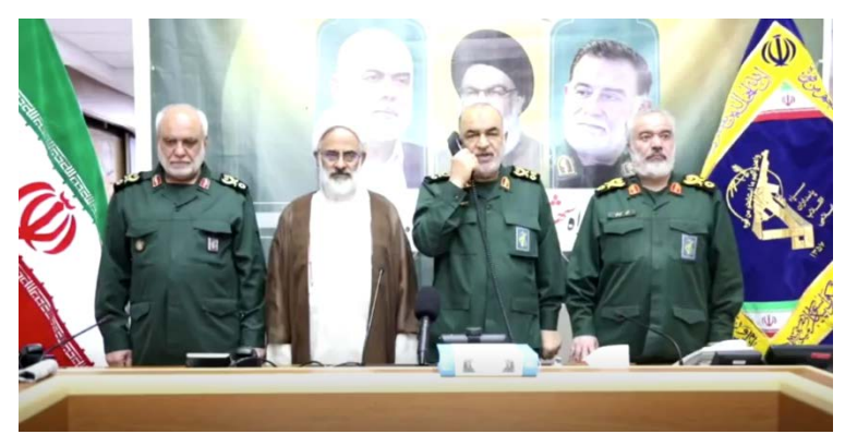
Right: The IRGC commander gives the order to launch (Tasnim, October 2, 2024). Left: One of the missiles fired at Israel (Tasnim, October 2, 2024)