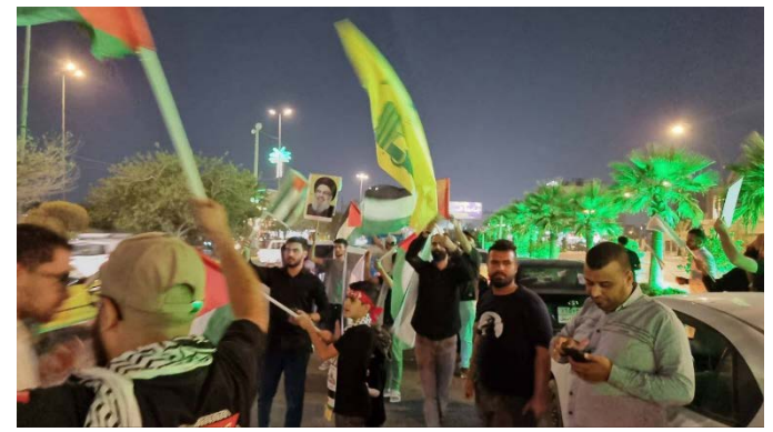
Celebrations in Iraq following the Iranian missile attack (Saberin News Telegram channel, October 1, 2024)

▶ Kata'ib Hezbollah praised the Iranian attack on Israel, saying it represented a commitment to the equation of confrontation "that the enemy is trying to undermine by harming civilians and civilian infrastructure." It was also claimed that the Iranian attack proved "the level of distress in which the enemy finds itself and the ability of the axis operatives to keep their promises" (Kaf Telegram channel, October 1, 2024).