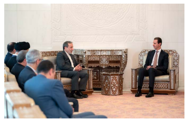
The meeting between Araghchi and Assad (the Syrian president's office Telegram channel, October 5, 2024)