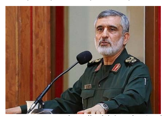
IRGC's aerospace arm commander Hajizadeh (Tasnim, October 13, 2024)

▶ Amir-Ali Hajizadeh, commander of the IRGC's aerospace arm, wrote in a letter sent following the Iranian attack on Israel on October 1, 2024, that the attack was "the minimum punishment for the criminal Zionist regime." He noted that the operation was fully supported by all the country's senior officials and approved by the Supreme National Security Council, with the support of the president and the commander of the armed forces. Hajizadeh added that members of the IRGC's aerospace arm and the other Iranian armed forces were on high alert and ready to respond decisively to any mistake by the enemy (Tasnim, October 13, 2024).