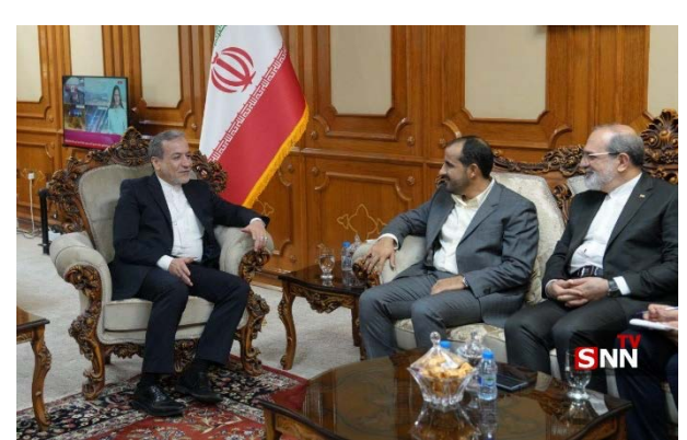
The Iranian foreign minister meets with the Houthi spokesman in Yemen (snn.ir, October 14, 2024)

▶ At the end of his visit to Iraq, Foreign Minister Araghchi continued to Oman. During the visit, the minister met with his Omani counterpart, Badr bin Hamad Al Busaidi, and discussed regional developments with him. Araghchi also met in Muscat with Yemeni Houthi spokesman Mohammed Abdulsalam (snn.ir, October 14, 2024).