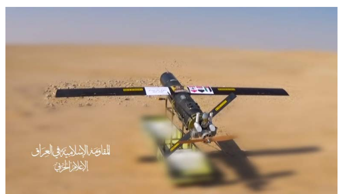
Drone being launched at the Golan Heights with a picture of Nasrallah and the flags of Iraq, Lebanon, and "Palestine" (Islamic Resistance in Iraq Telegram channel, October 10, 2024)

▶This past week, the Islamic Resistance in Iraq issued 14 claims of responsibility for 15 drone attacks against targets in Israel. The claim of responsibility for an attack against "a vital target in the eastern part of the occupied lands" asserted that it was carried out by an "aircraft with developed capabilities" but no details were provided (Islamic Resistance in Iraq Telegram channel, October 9-15, 2024). The IDF Spokesperson reported that three drones heading towards Israel from the east were intercepted on two separate occasions (IDF Spokesperson, October 9-15, 2024).