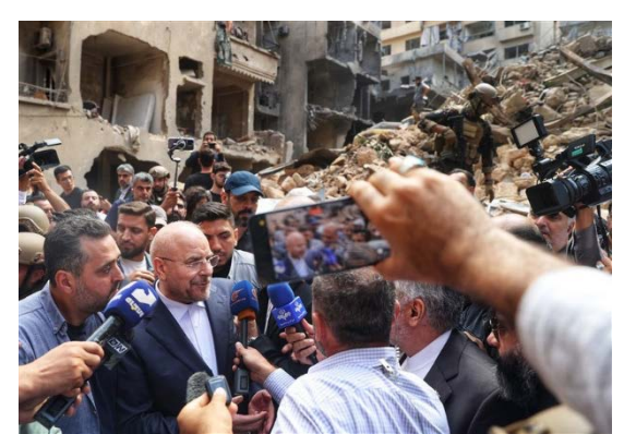
Qalibaf on a tour of the Dahiyeh